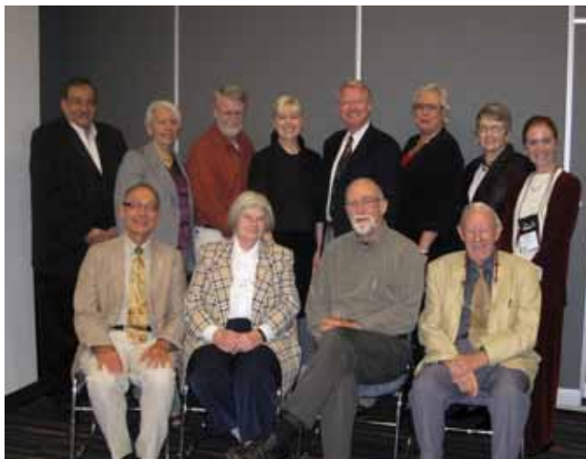
Back row, left to right: