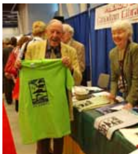
This photo was originally published in Feliciter, the magazine of the Canadian Library Association, Vol. 55, No. 4 (August 2009).