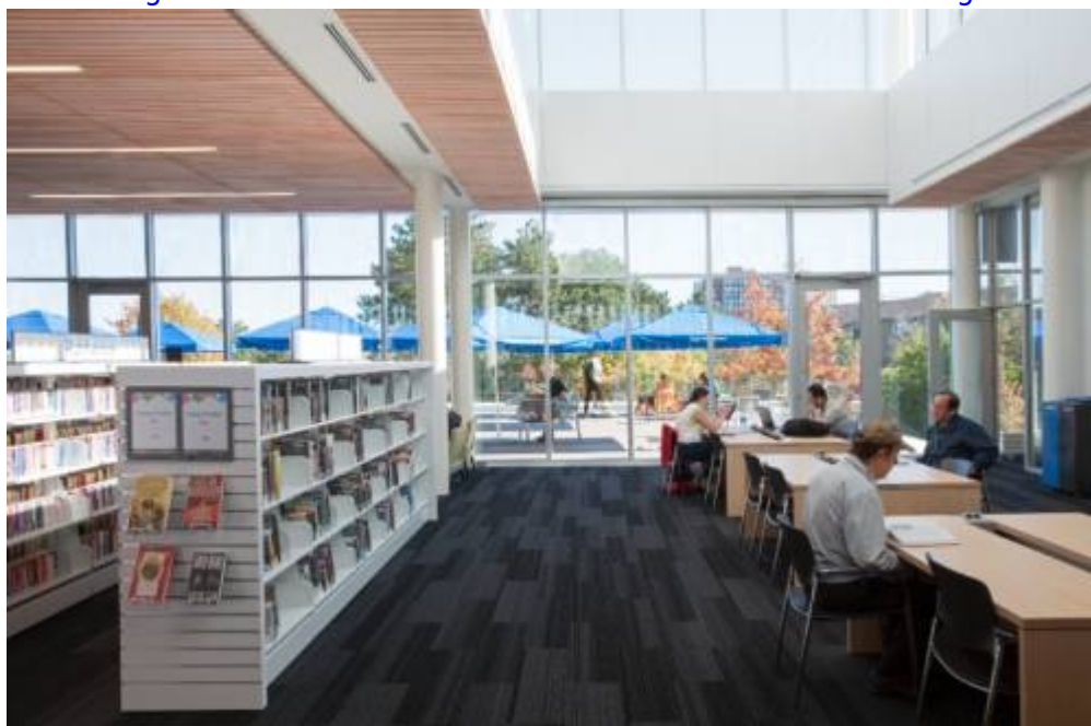
Mississauga-Meadowvale interior