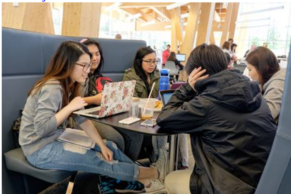
Scarborough branch teens hanging out