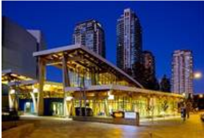
Scarborough Civic Centre Branch, Toronto, Credit TPL

Scarborough bluffs and lake Ontario shoreline. It brings animation to a formerly underutilized public space in a high density diverse neighbourhood and includes a public plaza, a reading garden, an echo-friendly green roof and a walkway link to the Civic Centre. It features TPL's third Digital Innovation Hub, a Kidstop Interactive Early Literacy Centre, all tables and stacks on wheels for maximum flexibility, high wooden ceilings and large welcoming floor-to-ceiling windows. The building has social and technological flexibility at its core. "There are basically no walls, just tree-like columns that everything can be arranged around depending on need." 9) This dynamic wood structure received an Ontario Woodwork Design Award in 2015, 2016 OLA Library Building Award (one of four) and the 2016 Ontario Association of Architects Design Excellence Award.