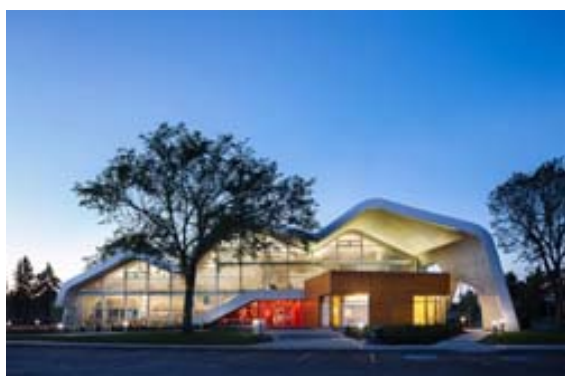
← Edmonton-Jasper Place.