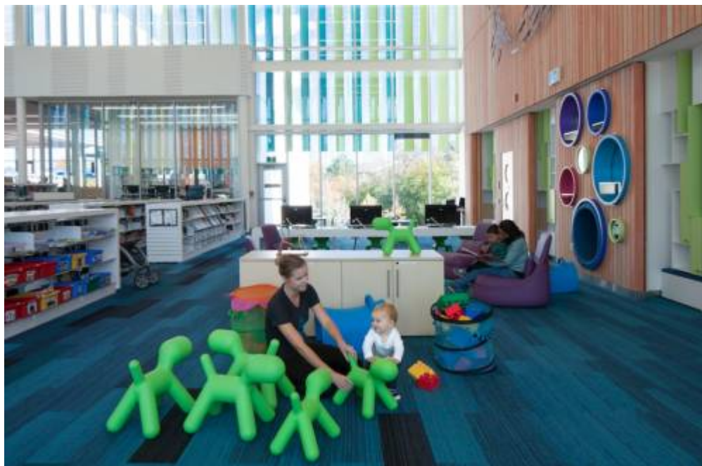
Mississauga-Meadowvale interior Children's section