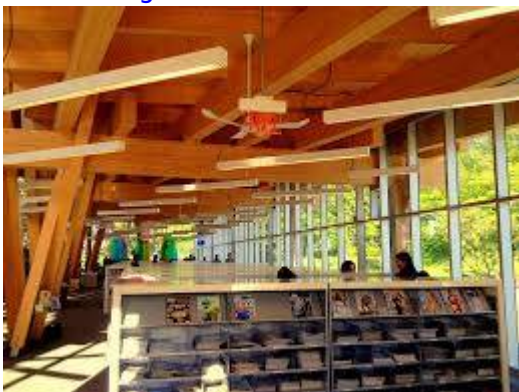
Scarborough branch interior