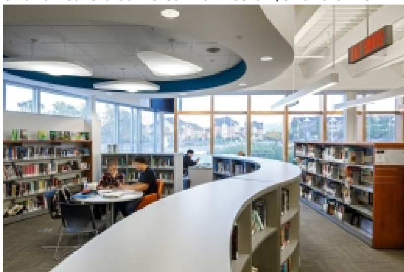
Ottawa-Beaverbrook.

Ottawa Public Library | Bibliothèque publique d'Ottawa , Beaverbrook branch . At a cost of $10M derived largely from development charges, this striking light-filled rebuild, opened in 2014, 5) and took the branch from 10K SF to 24K SF in north Kanata, a fast growing section of west Ottawa. During construction residents made good use of a nearby library kiosk. Designed by Moriyama and Tashima Architects, the building is LEED Silver and received one of only four Ontario Library Association/Library Building Awards in