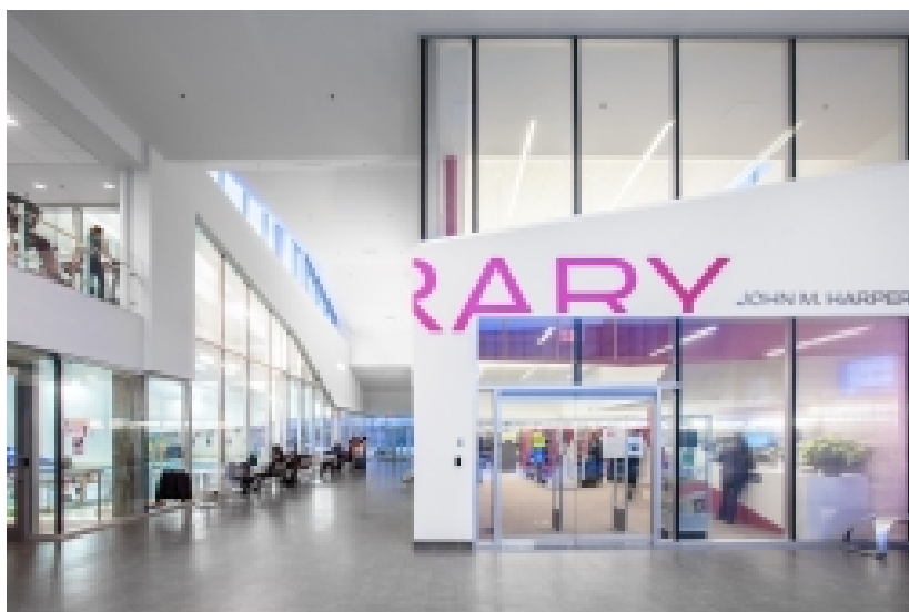
←Waterloo-John M Harper.

Waterloo Public Library, John M. Harper branch . Waterloo’s John M. Harper branch designed by Teeple Architects with Garwood, Jones and Hanham Architects, opened in 2011 at a total cost of $7.2M. 14) The architecturally stunning library is in a shared facility with Waterloo’s Stork Family YMCA with 21.5K SF composed of 17.8K SF of library space and 3.7K SF common space. The $22.3M facility was financed by the federal government gas tax, the City of Waterloo, the UMCA and the Library. The