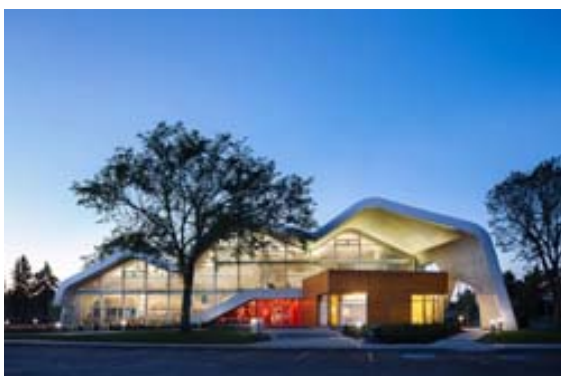
←Edmonton-Jasper Place.