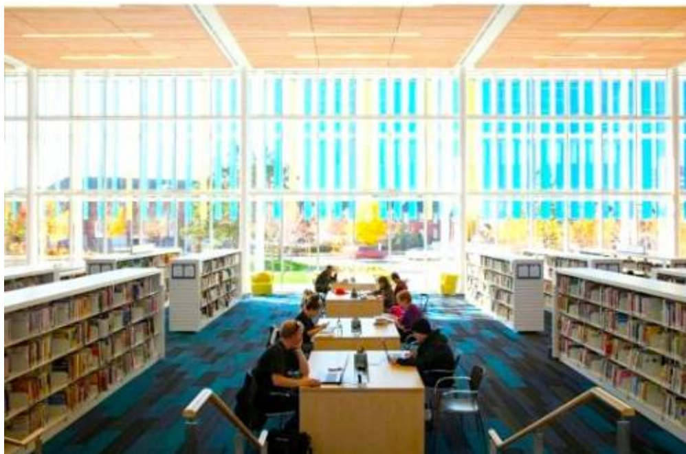
Mississauga-Meadowvale study area