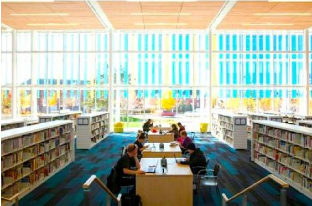
Mississauga-Meadowvale study area