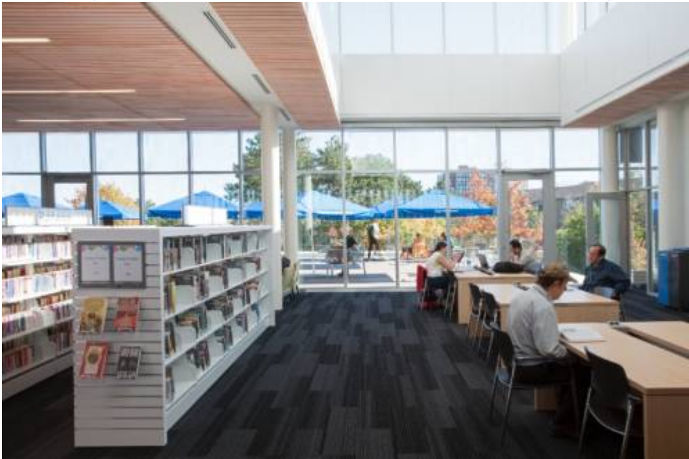
Mississauga-Meadowvale interior