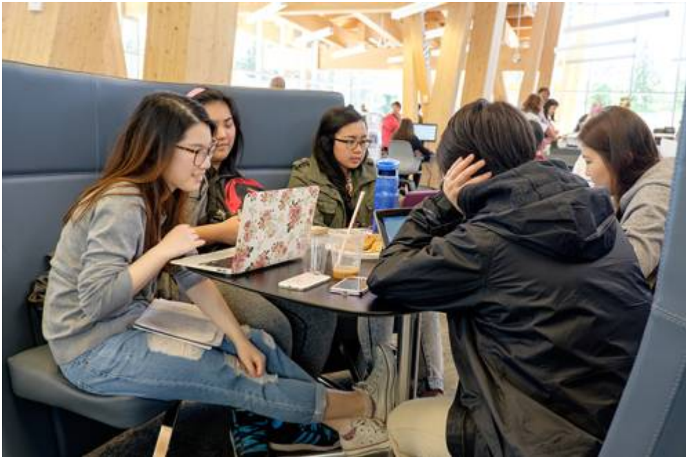
Scarborough branch teens hanging out