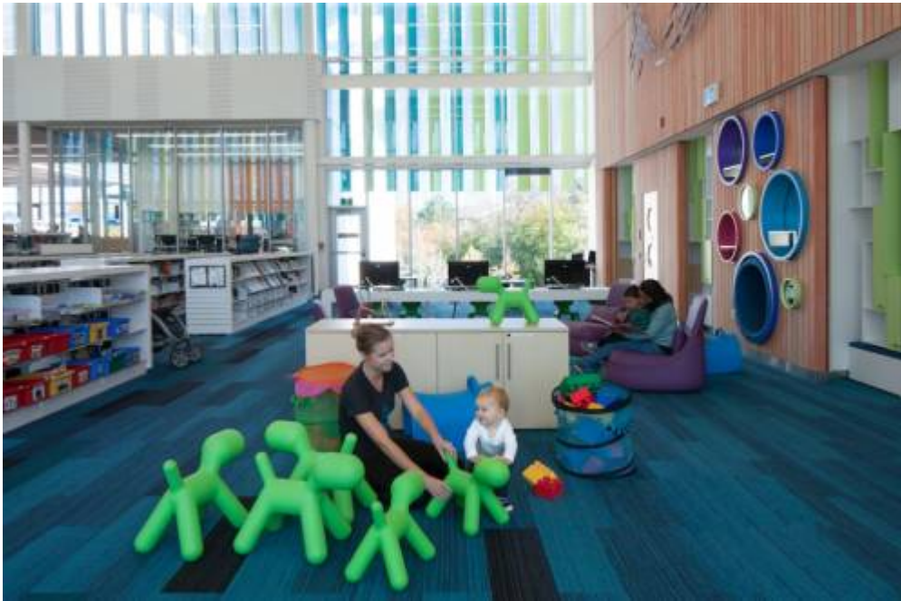
Mississauga-Meadowvale interior Children's section