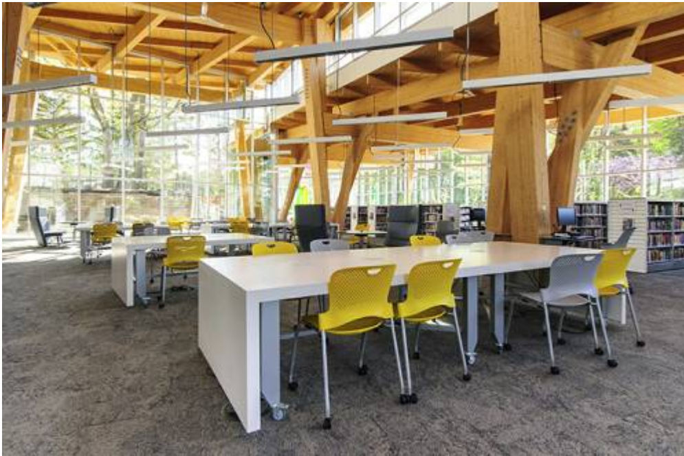
Scarborough branch interior