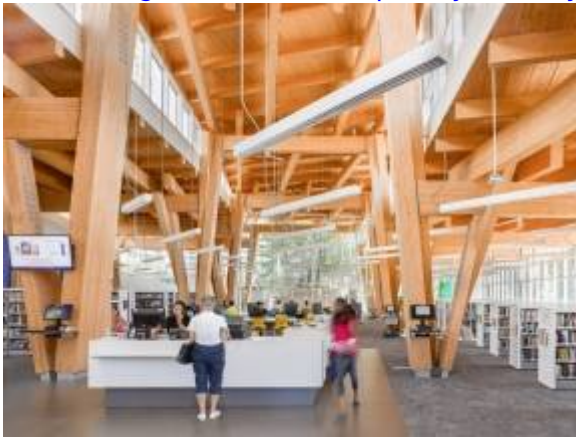
Scarborough branch interior