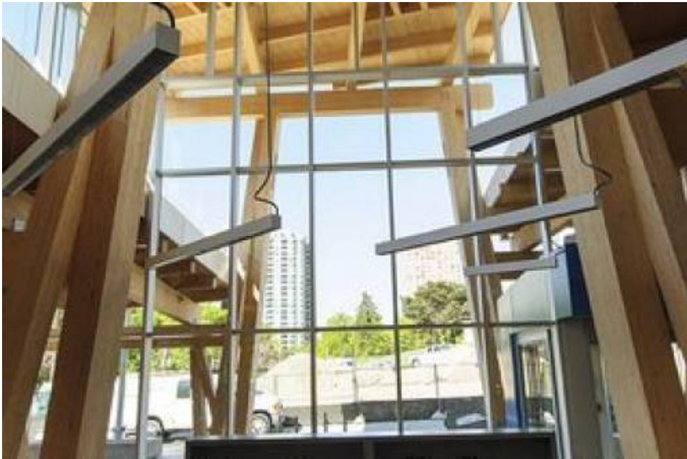
Scarborough branch interior