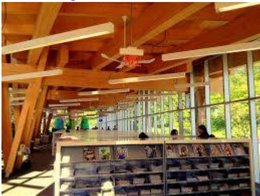
Scarborough branch interior