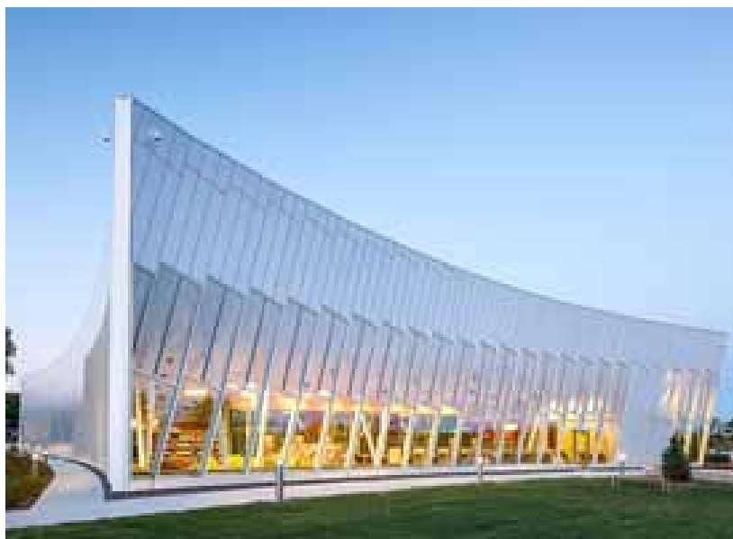
← Vaughan-Civic Centre Resource Library. Credit ZAS Architects+Interiors Vaughan Public Libraries, Civic Centre Resource Library branch library . The largest of the eight libraries featured in this article (and another Chatelaine cool library 12) ) is the spectacular new 36K SF Vaughan Civic Centre Resource Library. It opened May 2016 at a total cost of $22.1M and links Vaughan’s historic buildings to the west and the new city hall to the east. 13) Designed by Toronto’s ZAS Architects+Interiors it has two distinctive design concepts that create a sense of fun and delight: its sweeping curved roof and walls of glass and

reflective metal were inspired by the roller coaster at the nearby Canada’s Wonderland and theme park, and openness of the interiors creates an indoor space incorporating the elements you would find in a traditional Italian piazza including a central reading garden courtyard and patio where the community can gather, meet and exchange ideas. 14) Some of the key features include: an abundance of natural light, a Create It Studio including a green room and music recording studio, iPad and Notebook kiosk availability, self-check in and out, interactive family space with heated floor, Teen Zone, comfortable reading lounge with great views, collaboration rooms for group study, drive through book return, electron vehicle charging stations and a milk snake in an aquarium in the kids area. Designed for a LEED Silver rating, the CCRL is too new to have won any awards...but keep watching.