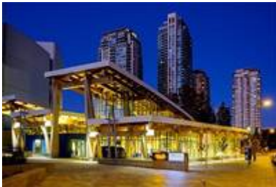
Scarborough Civic Centre Branch, Toronto

echoes the Scarborough bluffs and lake Ontario shoreline. It brings animation to a formerly underutilized public space in a high density diverse neighbourhood and includes a public plaza, a reading garden, an echo-friendly green roof and a walkway link to the Civic Centre. It features TPL's third Digital Innovation Hub, a Kidstop Interactive Early Literacy Centre, all tables and stacks on wheels for maximum flexibility, high wooden ceilings and large welcoming floor-to-ceiling windows. The building has social and technological flexibility at its core. "There are basically no walls, just tree-like columns that everything can be arranged around depending on need." 11 This dynamic wood structure received an Ontario Woodwork Design Award in 2015, 2016 OLA Library Building Award (one of four) and the 2016 Ontario Association of Architects Design Excellence Award.