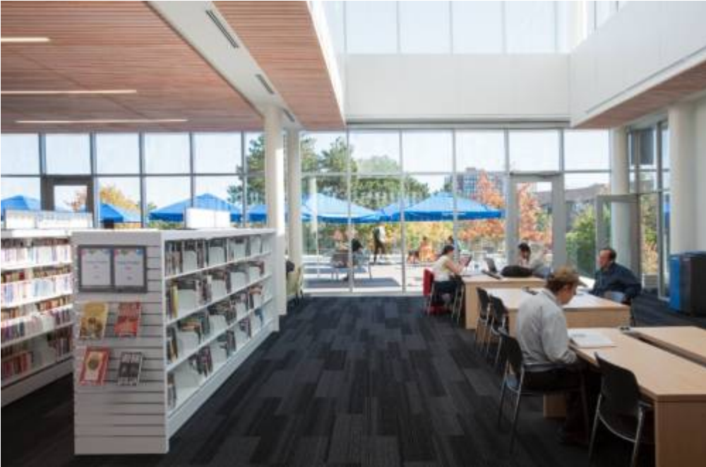
Mississauga-Meadowvale interior