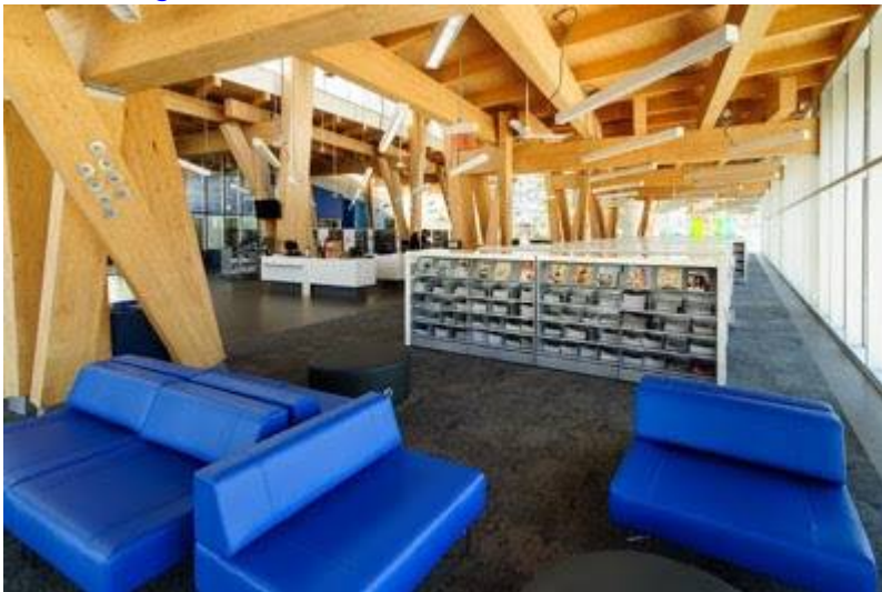
Scarborough Civic Centre branch interior