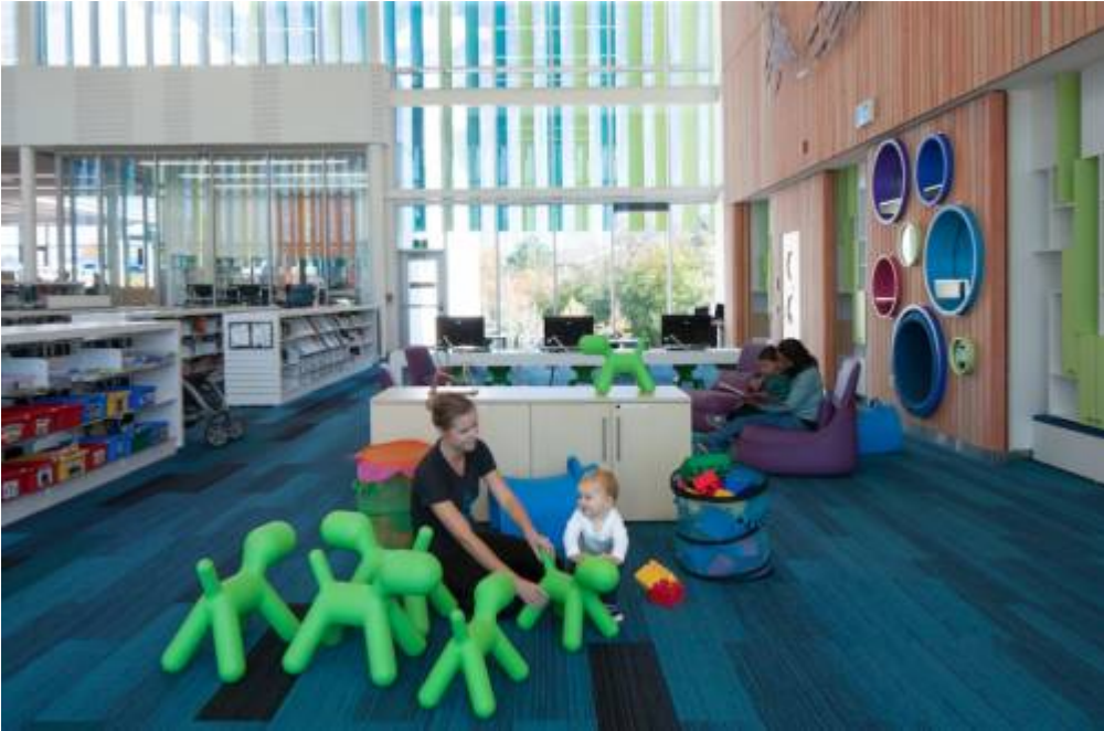
Mississauga-Meadowvale interior Children's section