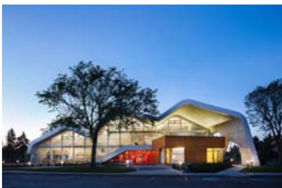
←Edmonton-Jasper Place.