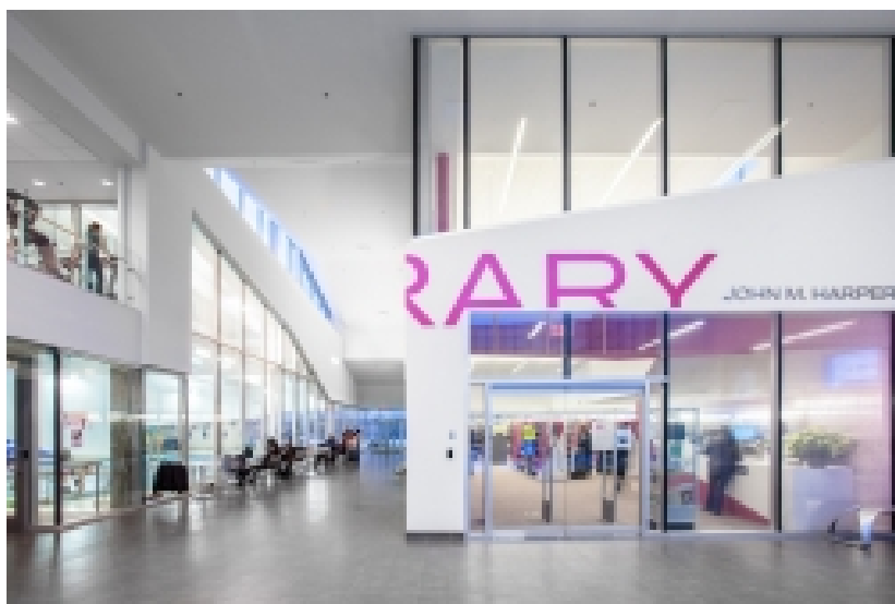
← Waterloo-John M Harper.

Waterloo Public Library, John M. Harper branch . Waterloo’s John M. Harper branch designed by Teeple Architects with Garwood, Jones and Hanham Architects, opened in 2011 at a total cost of $7.2M. 15) The architecturally stunning library is in a shared facility with Waterloo’s Stork Family YMCA with 21.5K SF composed of 17.8K SF of library space and 3.7K SF common space. The $22.3M facility was financed by the federal government gas tax, the City of Waterloo, the UMCA and the Library. The