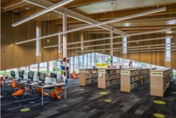
9.7 Toronto Public Library, Albion Branch.Computer Area.