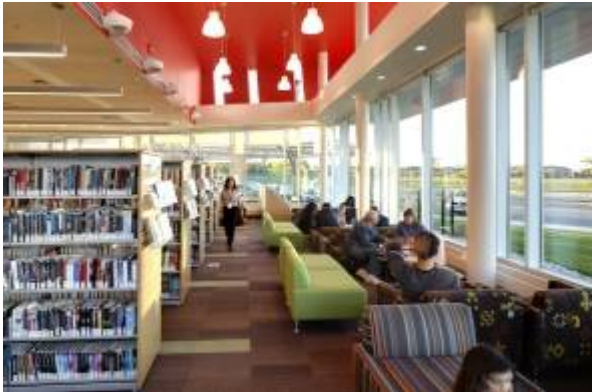
13.4 Vaughan Public Libraries, Pleasant Ridge Branch.