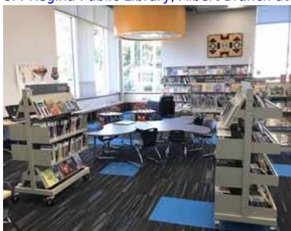
8.5 Regina Public Library, Albert Branch at m̄maw̄yatit̄an centre.Children's...