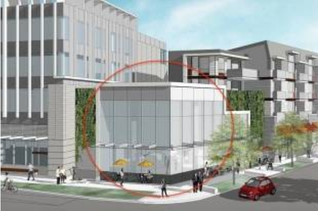
14.5 Greater Victoria Public Library, sx w enx w əŋ tənəx w James Bay Branch.Exterior against Capital Park development.