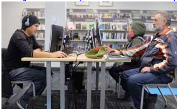
8.6 Regina Public Library, Albert Branch at m̄maw̄yatit̄an centre.Computer...