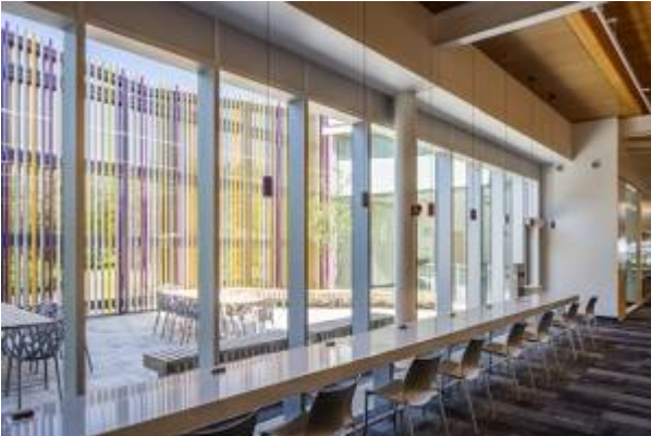
9.8 Toronto Public Library, Albion Branch.Computer area.