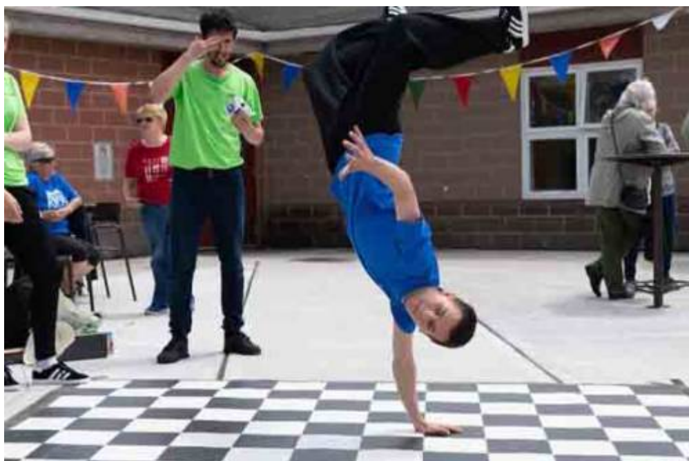
2.2 Halifax Public Libraries, Dartmouth North Branch-Outdoor Library. At the June 2018 opening, break dancers set up and impressed many.