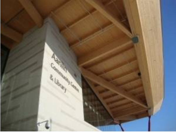
6.1 Markham Public Library, Aaniin Branch.Exterior.