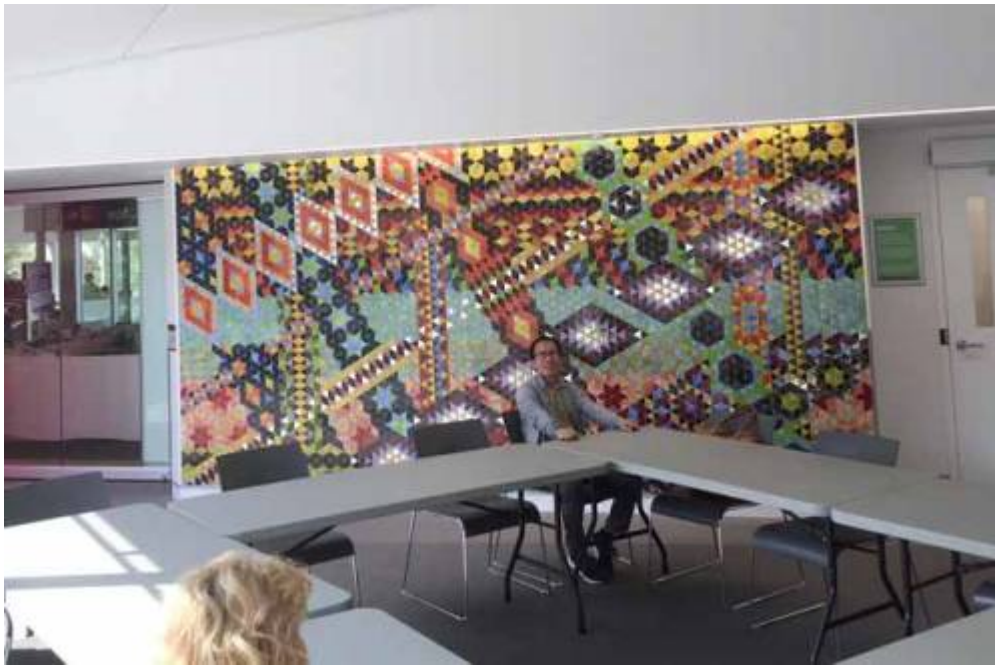
1.9 Edmonton Public Library, Calder Branch. Community mosaic.