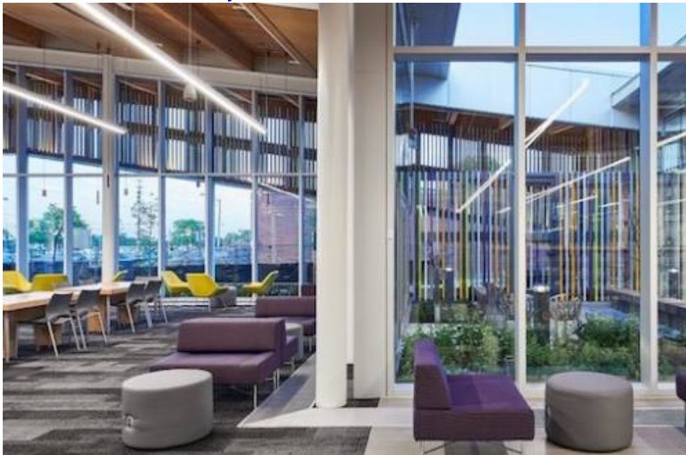
9.2 Toronto Public Library, Albion Branch.Interior/exterior.