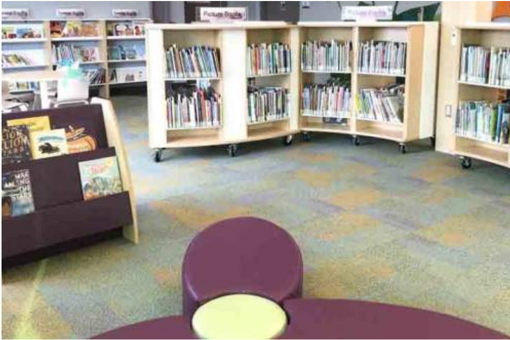
4.5 Kingston-Frontenac Public Library, Rideau Heights Branch. Children's...