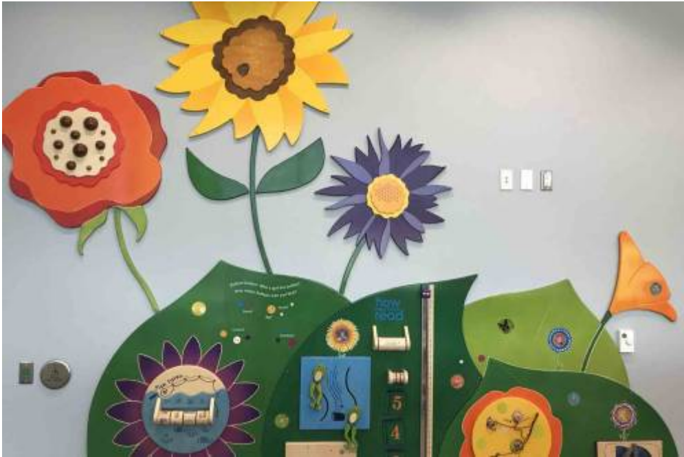
4.6 Kingston-Frontenac Public Library, Rideau Heights Branch. Children's...