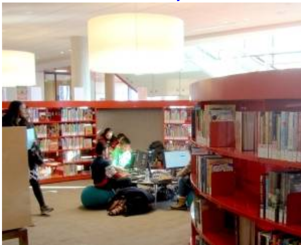
6.5 Markham Public Library, Aaniin Branch.Reading in The Worm.