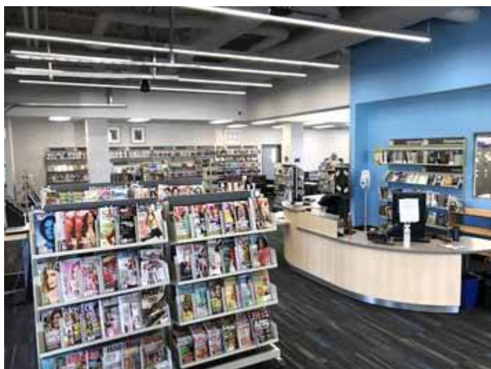
8.4 Regina Public Library, Albert Branch at m̄maw̄yatit̄an...