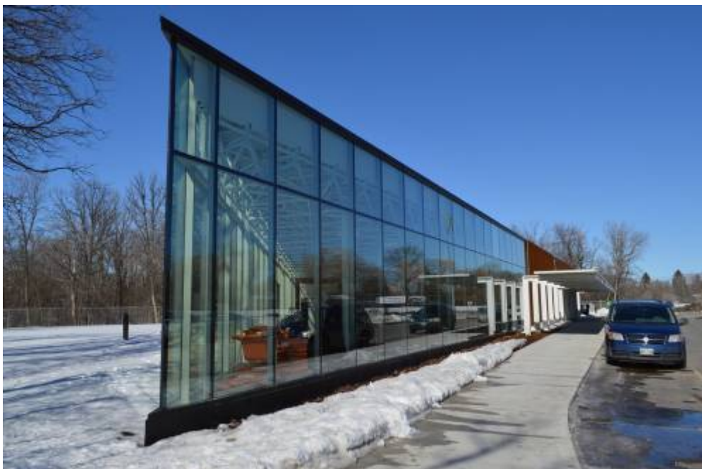
15.1 Winnipeg Public Library, Windsor Park Branch. Exterior.

Bigger, Brighter, more accessible: New Windsor Park Library Opens Doors (CBC News Mar 15, 2018) (accessed Sept 28, 2018)