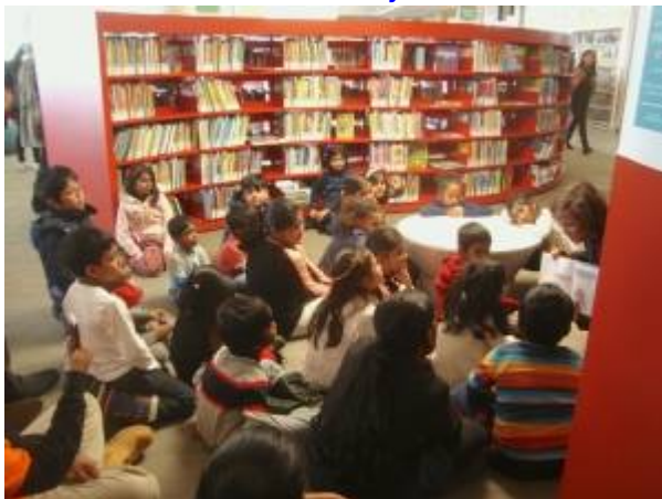
6.6 Markham Public Library, Aaniin Branch.Children's program in The Worm....