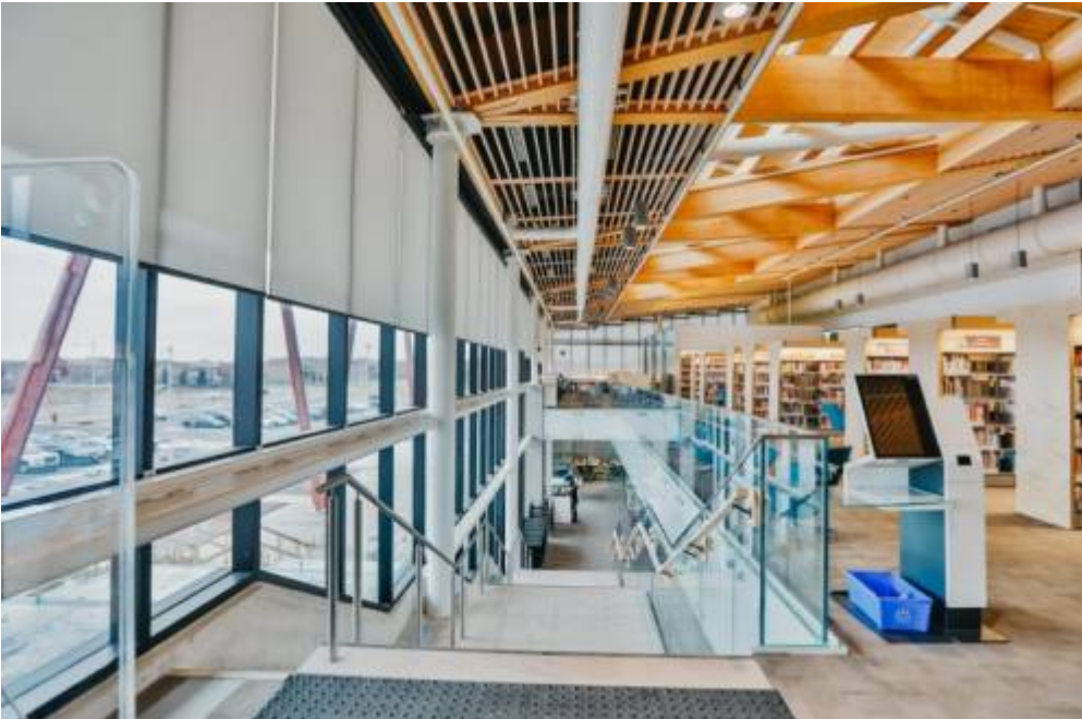
6.3 Markham Public Library, Aaniin Branch.Upper Level.