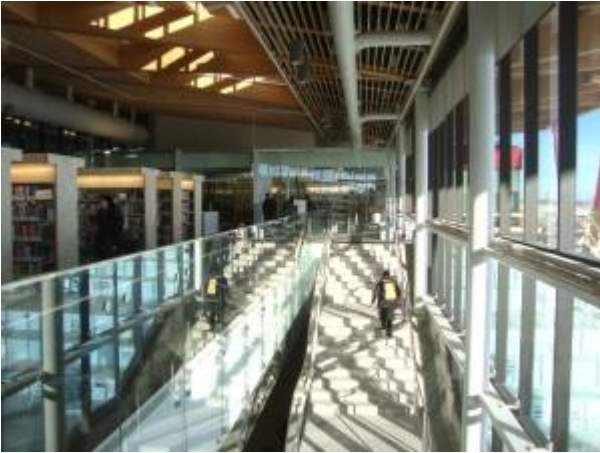
6.2 Markham Public Library, Aaniin Branch.Grand Staircase.