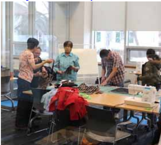
8.9 Regina Public Library, Albert Branch at māmawēyatitān centre. Flex space...