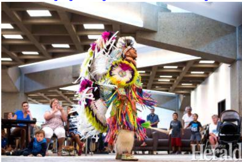
5.5 Lethbridge Public Library, Main Branch. Performance of Fancy Dance at a Blackfoot dance demonstration at the library.