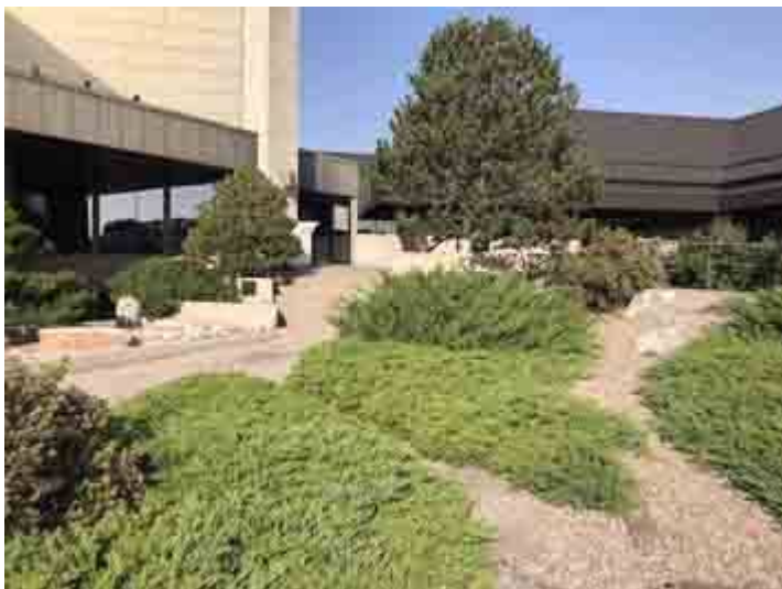
5.1 Lethbridge Public Library, Main Branch. Exterior.Credit.Lethbridge Public...

Downtown public library fully reopens after two years renovations (accessed Sept 28, 2018)