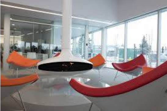
1.5 Edmonton Public Library, Calder Branch. Fireplace reading area.