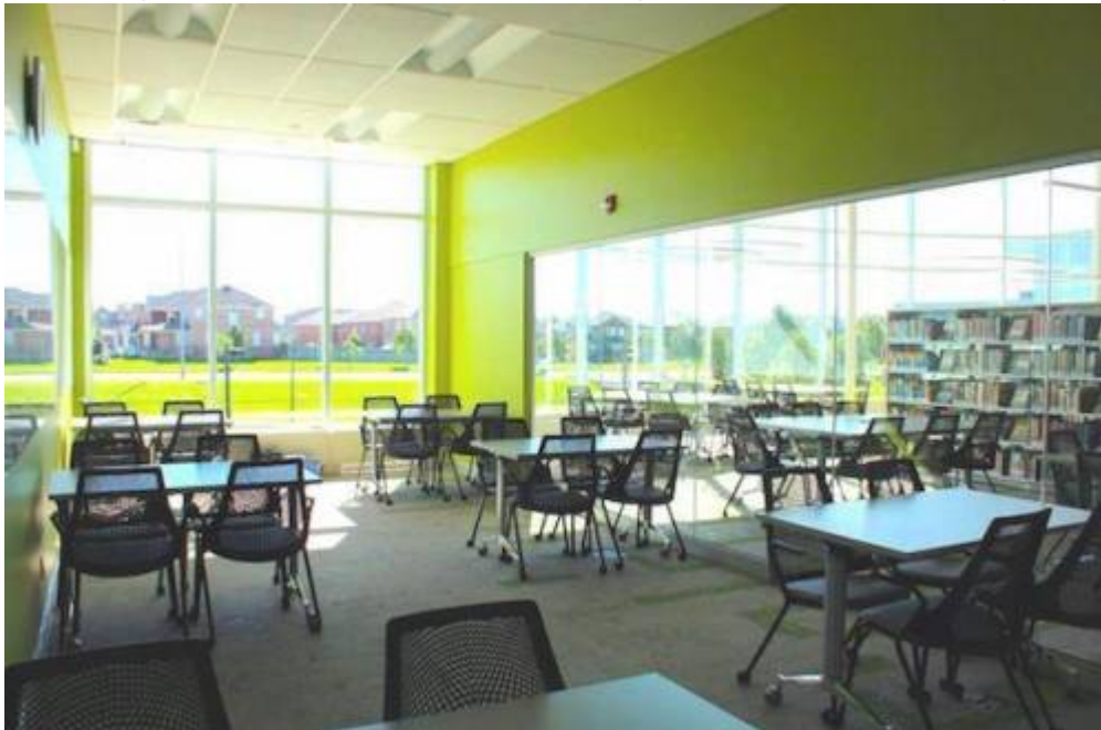
12.4 Vaughan Public Libraries, Vellore Village Branch. Study area.