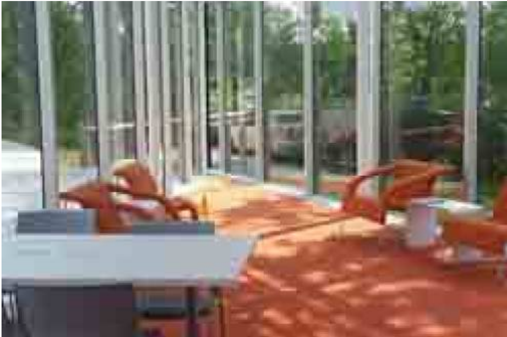
15.7 Winnipeg Public Library, Windsor Park Branch. Casual reading...