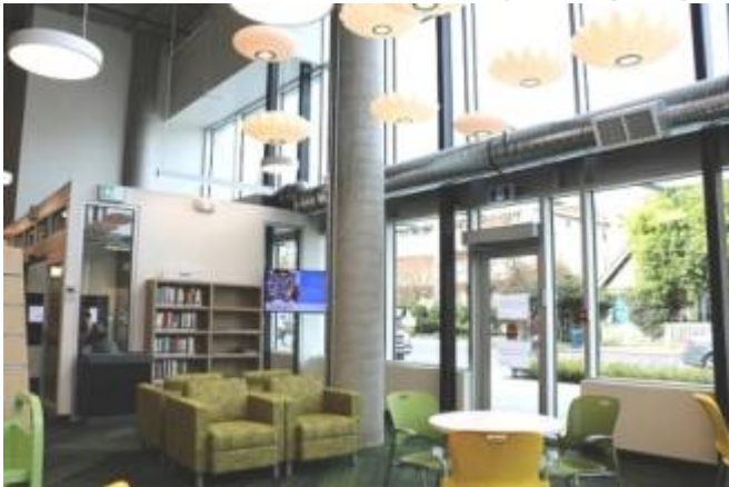
14.3 Greater Victoria Public Library, sx w enx w əŋ təŋəx w James Bay...