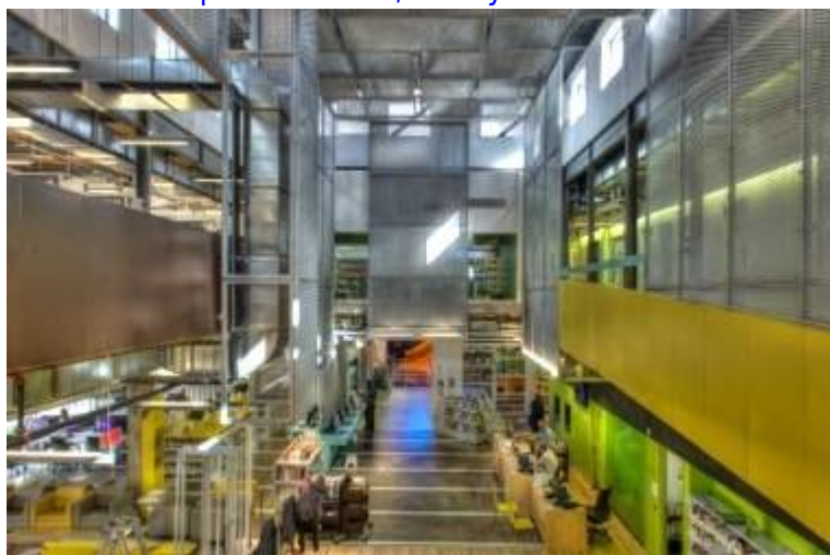
7.2 Bibliothèques Montréal,Benny Branch.Interior.