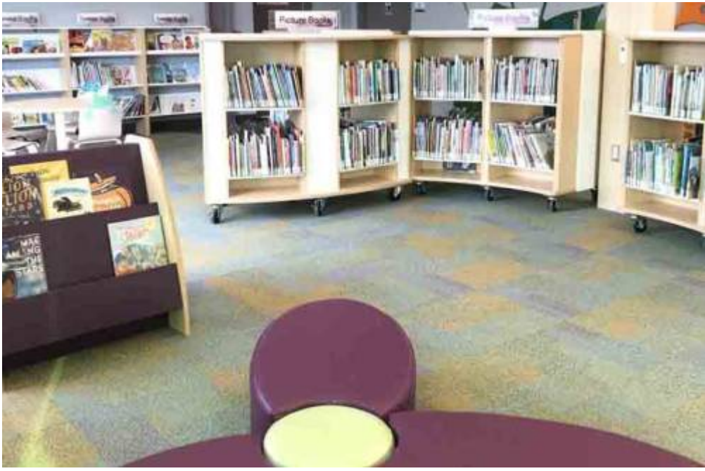
4.5 Kingston-Frontenac Public Library, Rideau Heights Branch. Children's...