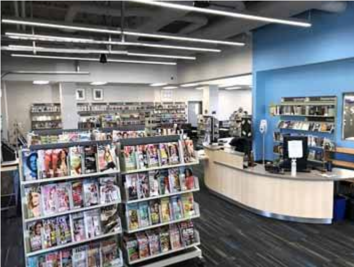
8.4 Regina Public Library, Albert Branch at m̄maw̄yatit̄an...