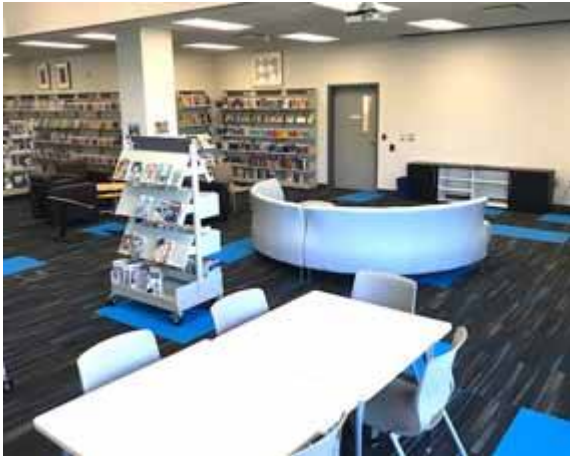
8.11 Regina Public Library, Albert Branch at m̄maw̄yatit̄an centre.Teen...