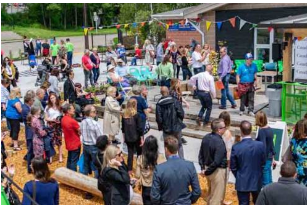
2.1 Halifax Public Libraries, Dartmouth North Branch-Outdoor Library. A large stone tiled area makes room for the imagination to fill.

Dartmouth north renovation project (accessed Sept 28, 2018)