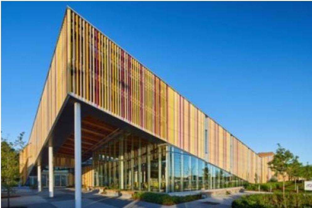
9.1 Toronto Public Library, Albion Branch.

Ten things to check at Albion branch (accessed Sept 28, 2018)