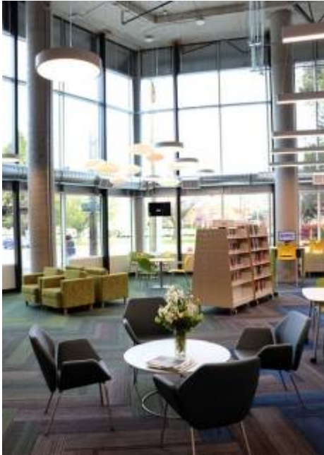
14.2 Greater Victoria Public Library, sx w enx w əŋ təŋəx w James Bay...