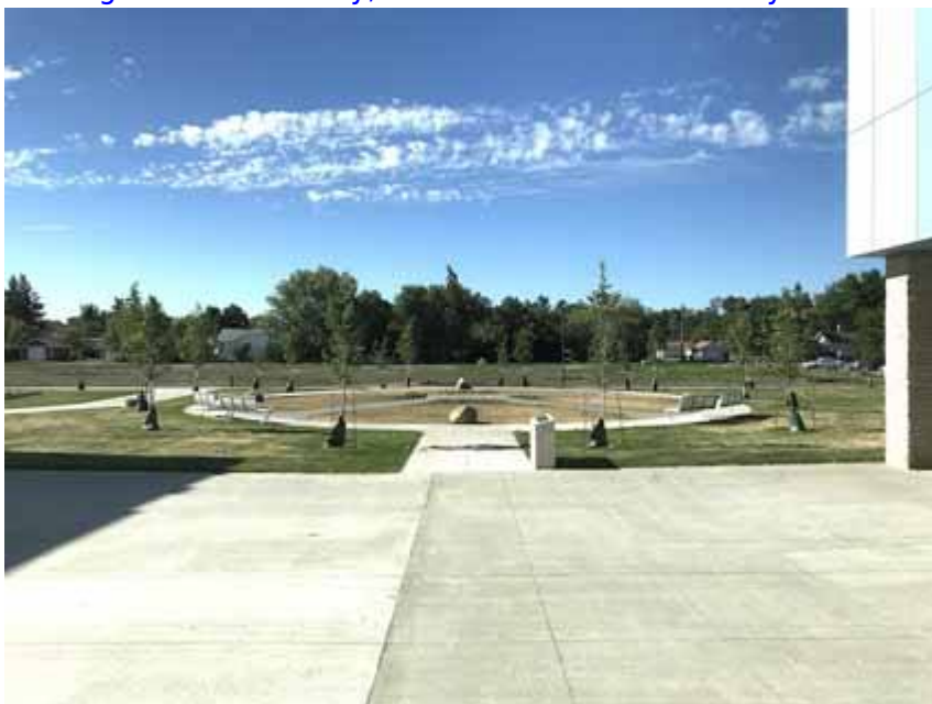
8.3 Regina Public Library, Albert Branch at mâdawêyatitân centre.Exterior....