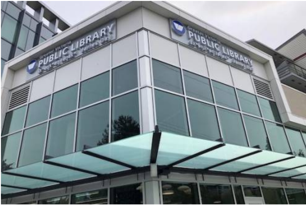
14.1 Greater Victoria Public Library, sx w enx w əŋ təŋəx w James Bay...