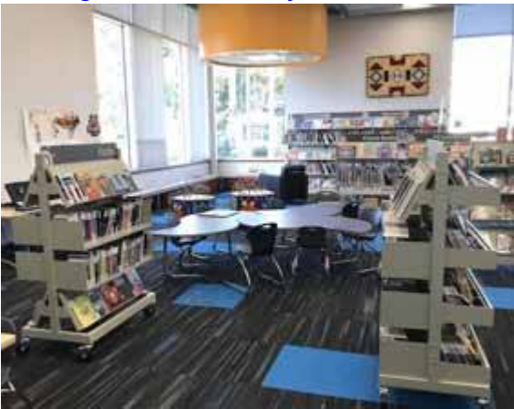
8.5 Regina Public Library, Albert Branch at m̄maw̄yatit̄an centre.Children's...