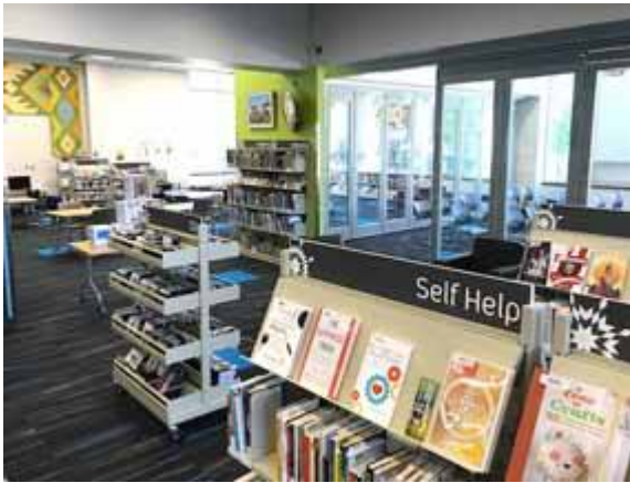
8.10 Regina Public Library, Albert Branch at m̄maw̄yatit̄an centre.Children's...