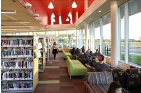
13.4 Vaughan Public Libraries, Pleasant Ridge Branch.