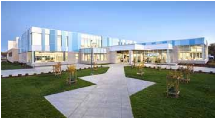
8.1 Regina Public Library, Albert Branch at mâdawêyatitân centre. Exterior....

Regina integrated services centre first of its kind in Canada (accessed Sept 28 2018)