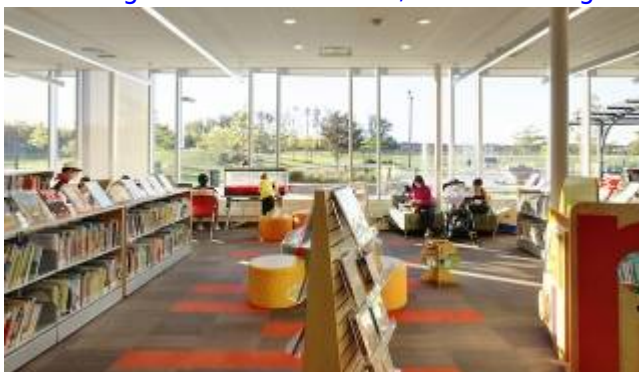
13.2 Vaughan Public Libraries, Pleasant Ridge Branch.