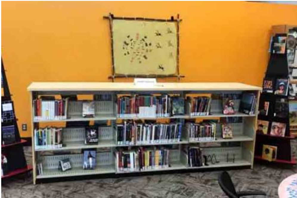
5.4 Lethbridge Public Library, Main Branch. New First Nations, Metis, Inuit area called Piitoyiss in the Blackfoot language or Eagles' Nest.Credit.Lethbridge...