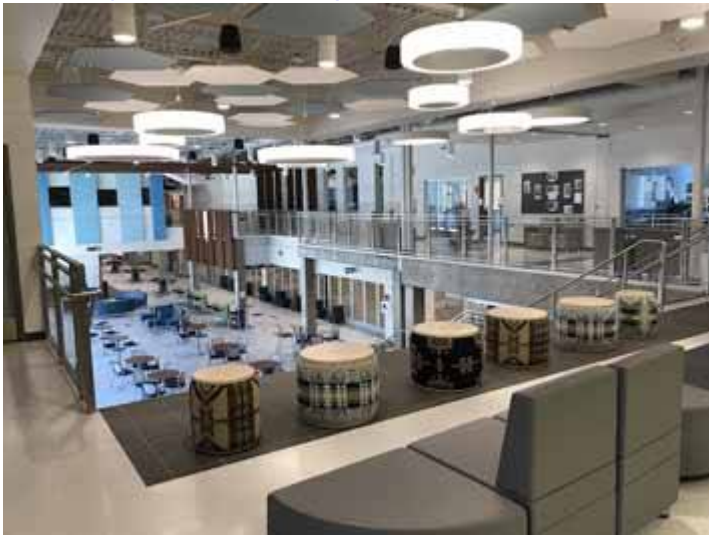
8.12 Regina Public Library, Albert Branch at m̄maw̄yatit̄an centre.Centre...