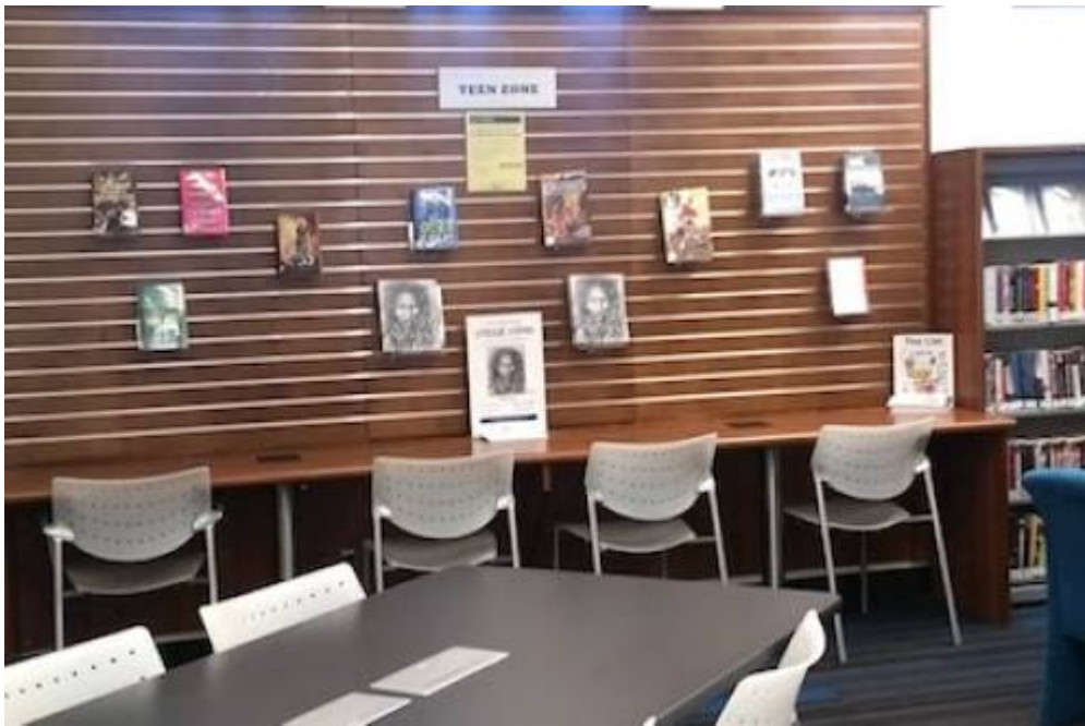
10.4 Toronto Public Library, Amesbury Park Branch. Part of Teen Zone...