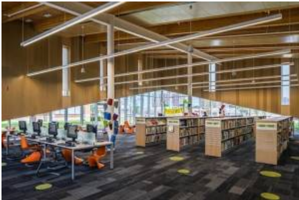
9.7 Toronto Public Library, Albion Branch.Computer Area.