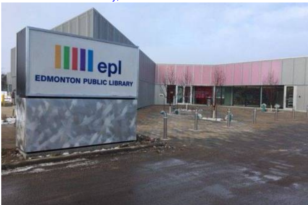
1.2 Edmonton Public Library, Calder Branch. Exterior.