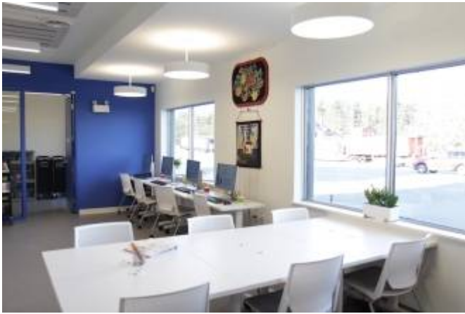
3.4 Halifax Public Libraries, Musquodoboit Branch. Computer and study...