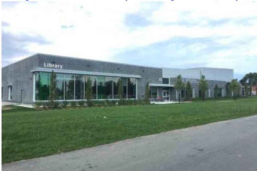
4.2 Kingston-Frontenac Public Library, Rideau Heights Branch. Library Branch and...