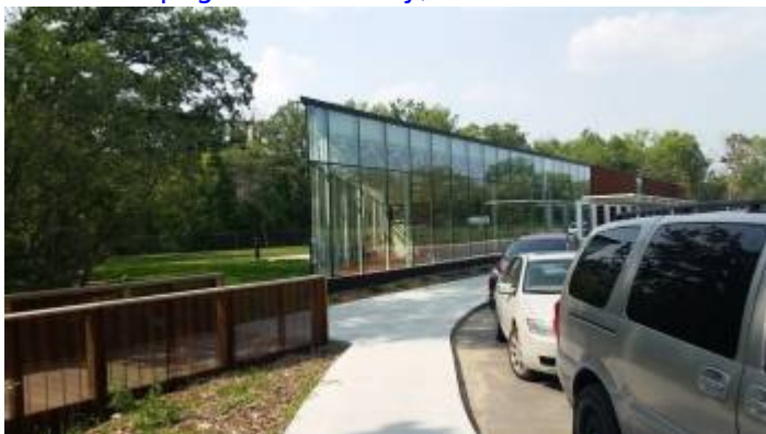
15.2 Winnipeg Public Library, Windsor Park Branch. Exterior, footbridge to...