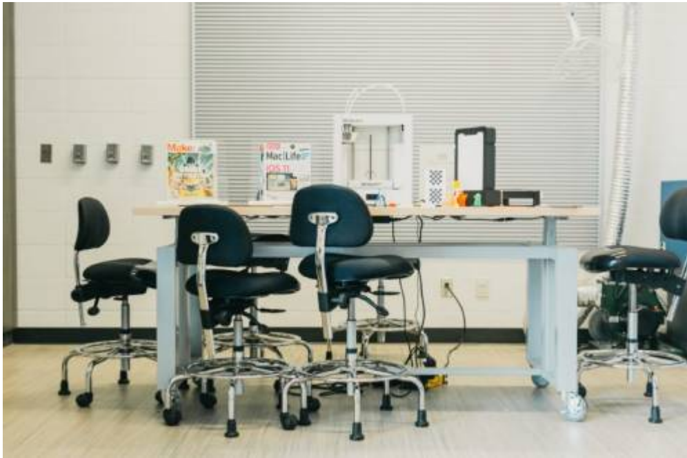
6.7 Markham Public Library, Aaniin Branch.Teen Zone.