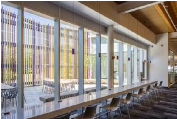
9.8 Toronto Public Library, Albion Branch.Computer area.