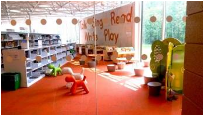
15.6 Winnipeg Public Library, Windsor Park Branch. Children's area looking into...