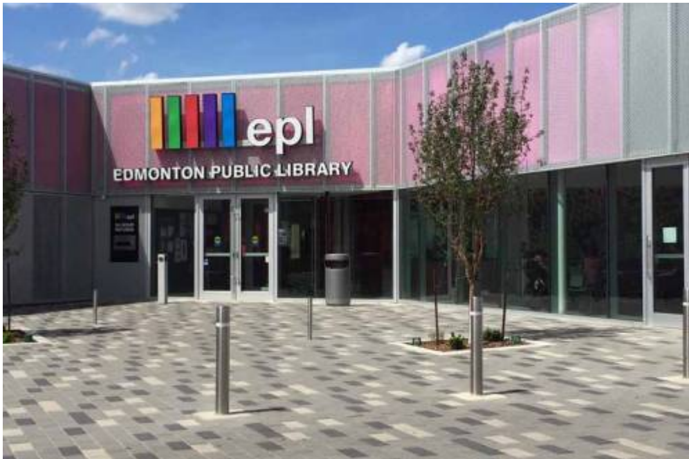
1.1 Edmonton Public Library, Calder Branch. Exterior.