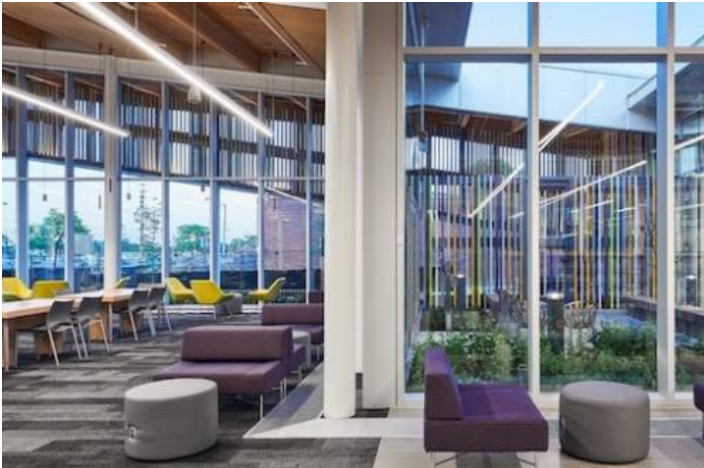
9.2 Toronto Public Library, Albion Branch.Interior/exterior.