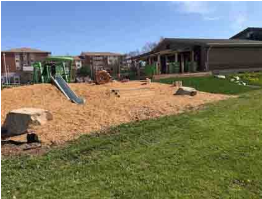
2.6 Halifax Public Libraries, Dartmouth North Branch-Outdoor Library. A rare quiet moment at the Outdoor Library with joint library-community centre in...