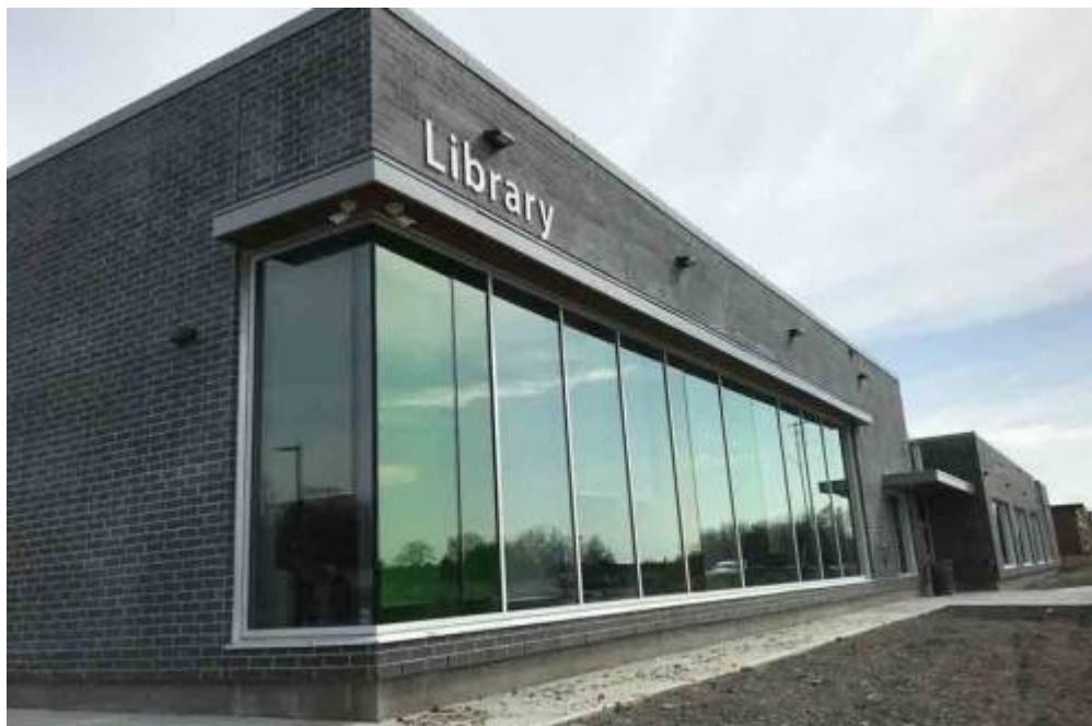
4.1 Kingston-Frontenac Public Library, Rideau Heights Branch. Library Branch and...