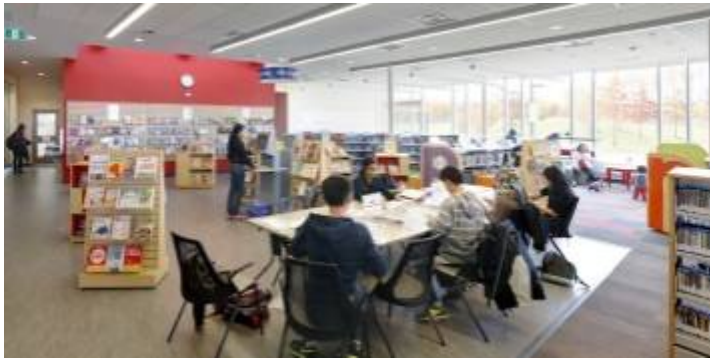
13.3 Vaughan Public Libraries, Pleasant Ridge Branch.