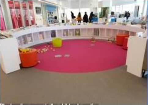
1.4 Edmonton Public Library, Calder Branch. Children's area.