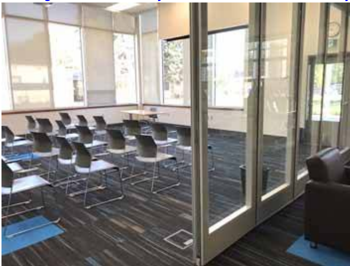
8.8 Regina Public Library, Albert Branch at māmawēyatitān centre. Flex...