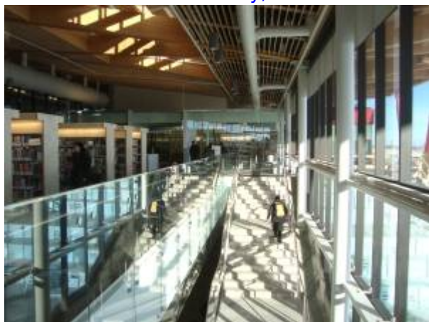
6.2 Markham Public Library, Aaniin Branch.Grand Staircase.