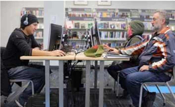
8.6 Regina Public Library, Albert Branch at m̄maw̄yatit̄an centre.Computer...