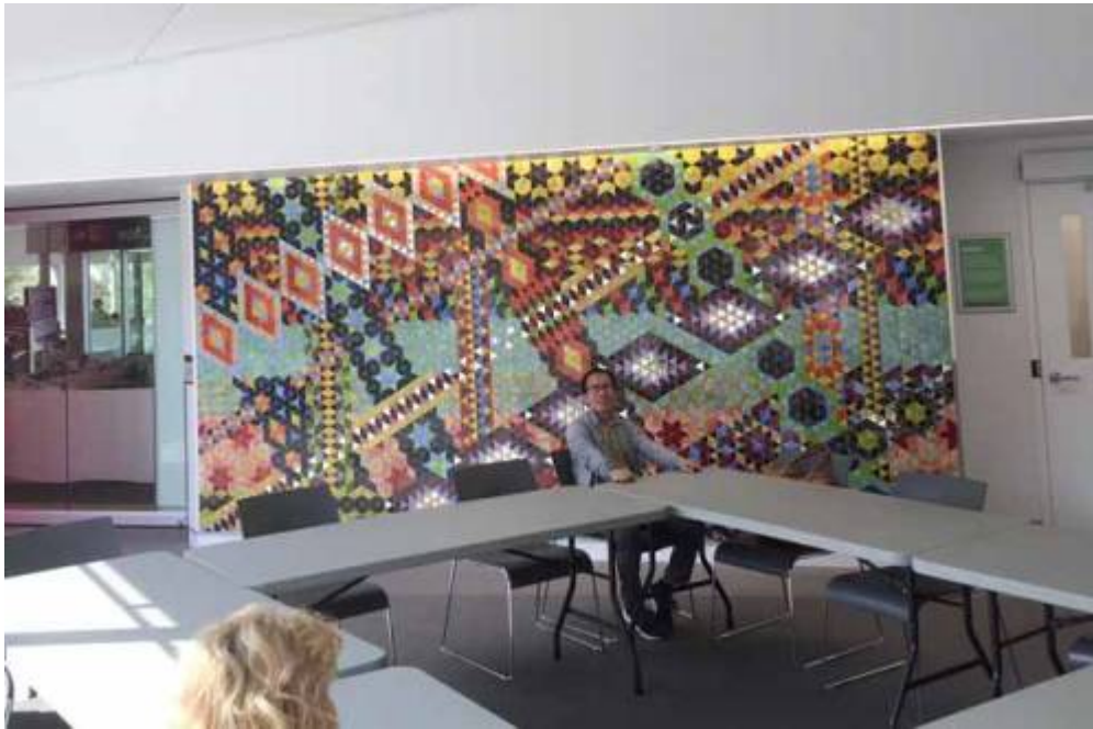
1.9 Edmonton Public Library,Calder Branch. Community mosaic.