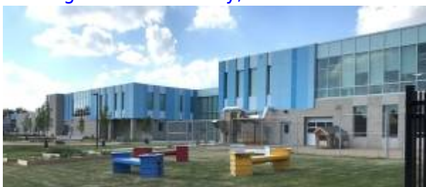
8.2 Regina Public Library, Albert Branch at mâdawêyatitân centre.Exterior...