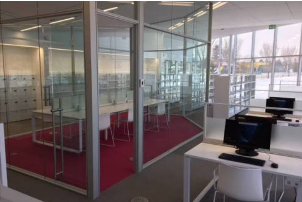
1.6 Edmonton Public Library, Calder Branch. Study Room.