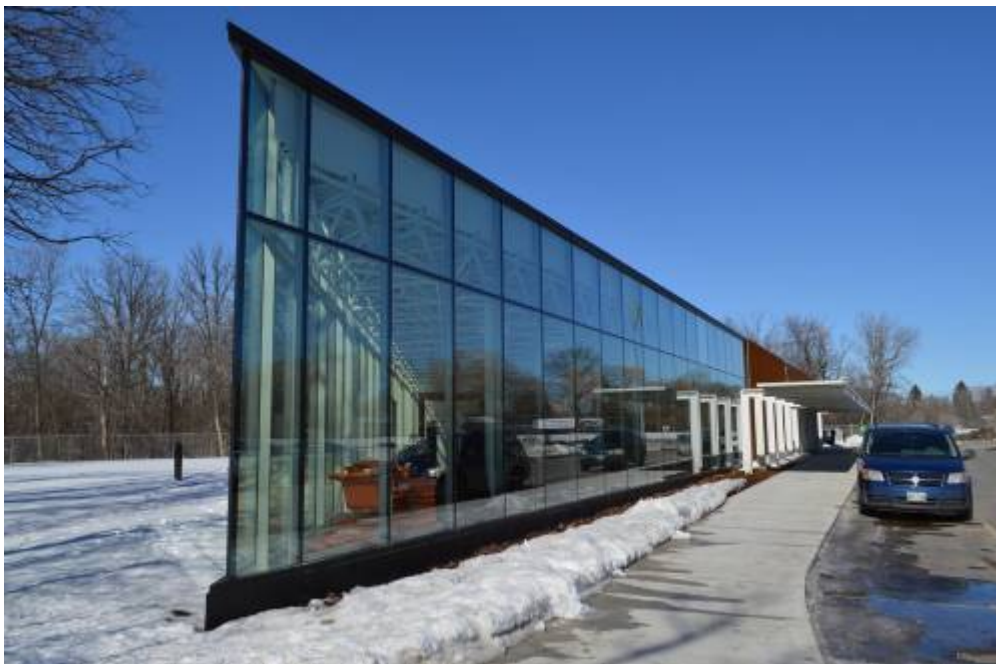
15.1 Winnipeg Public Library, Windsor Park Branch. Exterior.

Bigger, Brighter, more accessible: New Windsor Park Library Opens Doors (CBC News Mar 15, 2018) (accessed Sept 28, 2018)