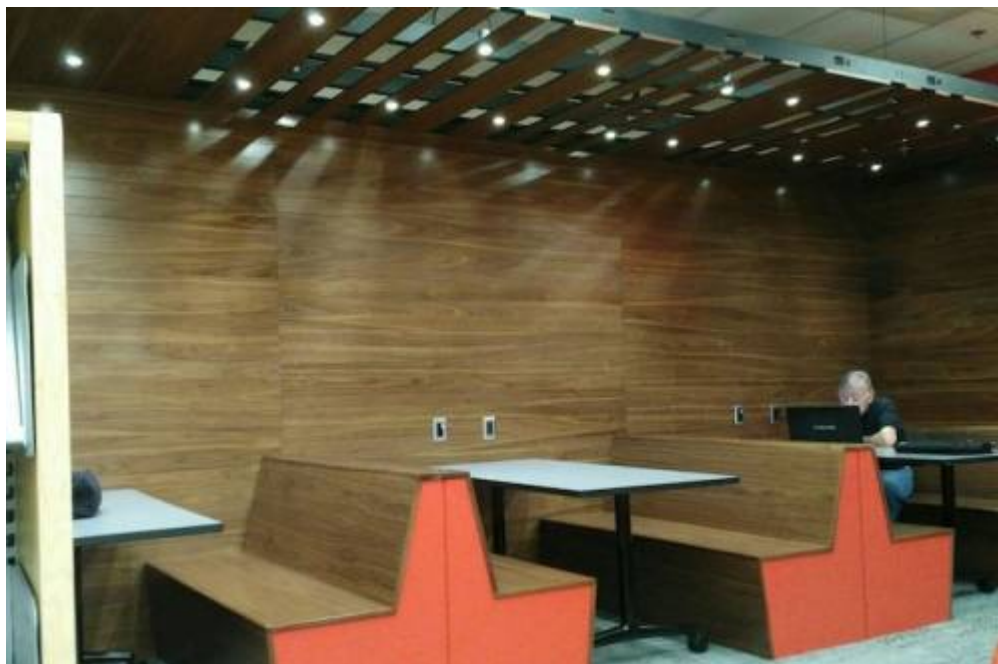
11.3 Toronto Public Library, Eglinton Square Branch. Teen section.