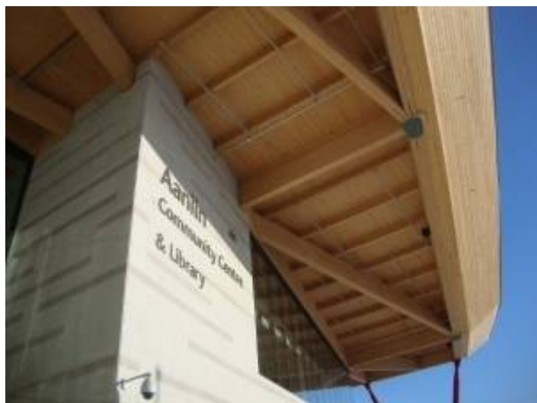
6.1 Markham Public Library, Aaniin Branch.Exterior.