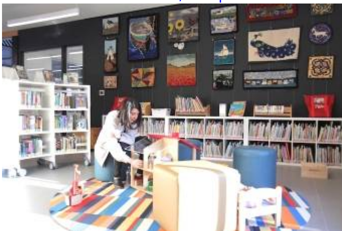
3.2 Halifax Public Libraries, Musquodoboit Branch.Kids' Nook.