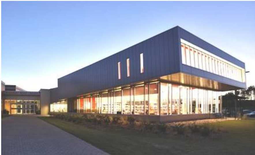
13.5 Vaughan Public Libraries, Pleasant Ridge Branch at night.