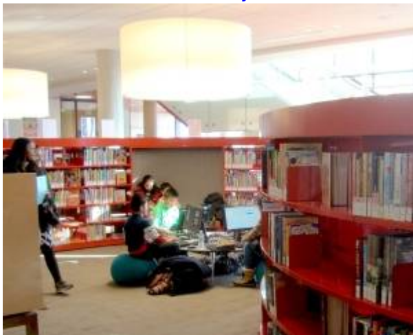
6.5 Markham Public Library, Aaniin Branch.Reading in The Worm.