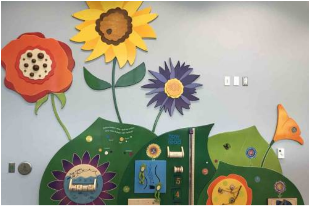
4.6 Kingston-Frontenac Public Library, Rideau Heights Branch. Children's...