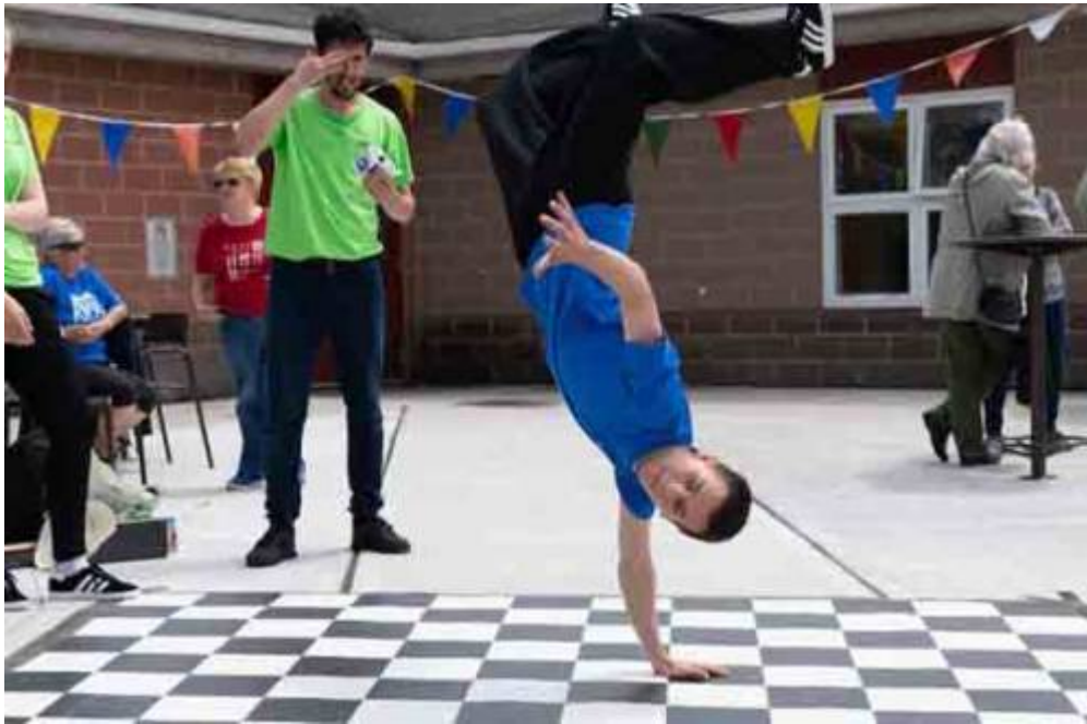
2.2 Halifax Public Libraries, Dartmouth North Branch-Outdoor Library. At the June 2018 opening, break dancers set up and impressed many.