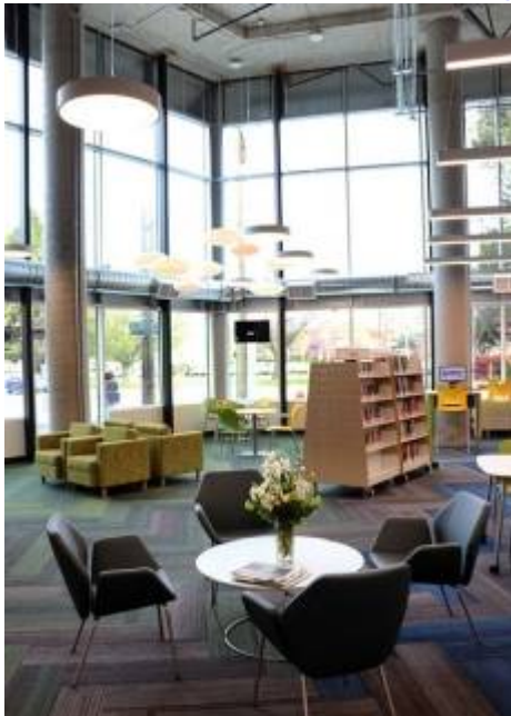
14.2 Greater Victoria Public Library, sxʷenxʷəŋ təŋəxʷ James Bay...