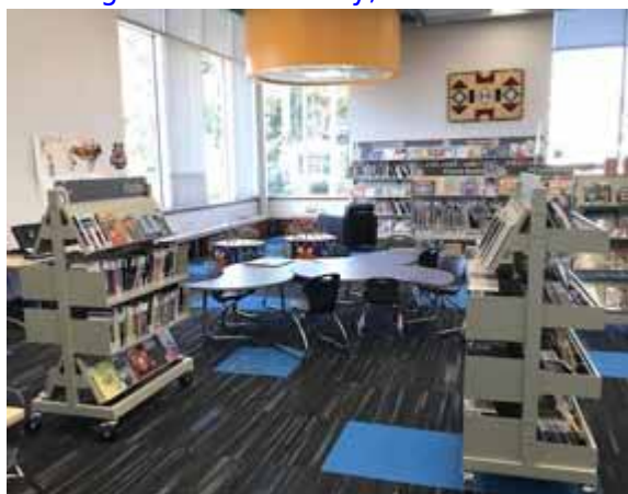
8.5 Regina Public Library, Albert Branch at mawawatatân centre.Children's...