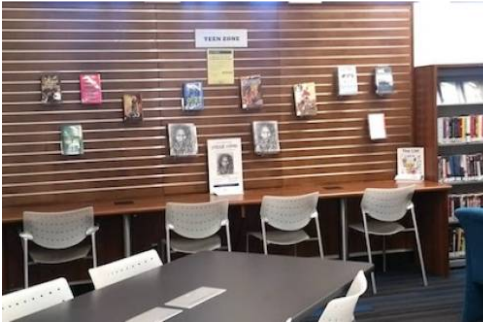
10.4 Toronto Public Library, Amesbury Park Branch. Part of Teen Zone...