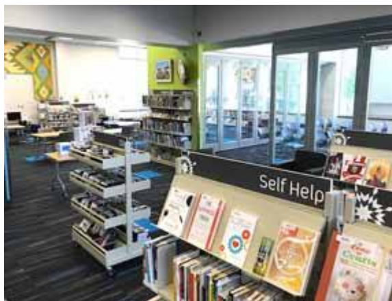
8.10 Regina Public Library, Albert Branch at māmawēyatitān centre.Children's...