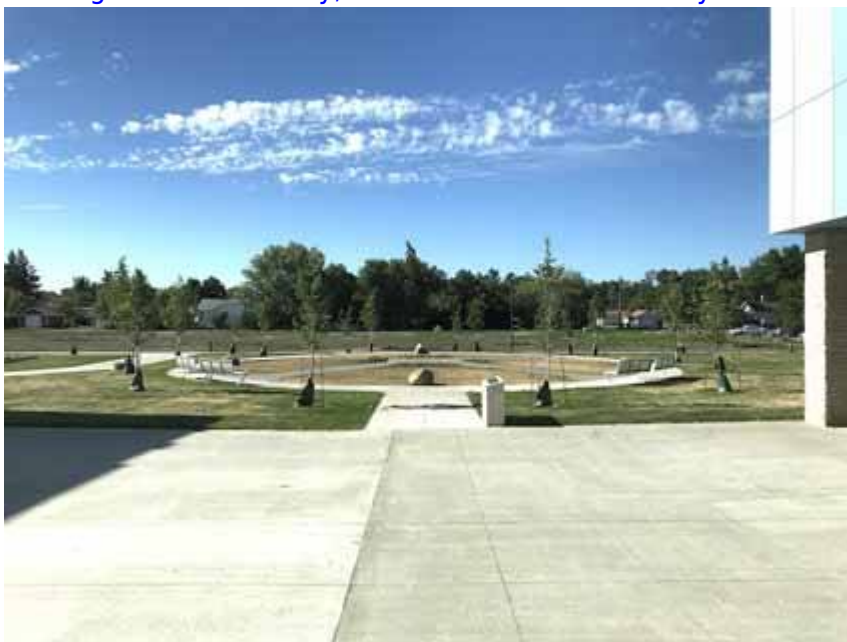
8.3 Regina Public Library, Albert Branch at mâdawêyatitân centre.Exterior....