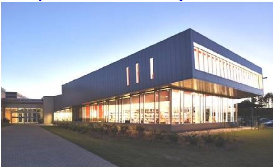
13.5 Vaughan Public Libraries, Pleasant Ridge Branch at night.