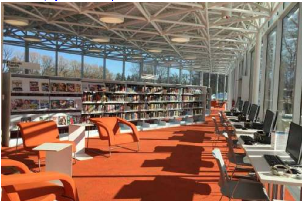
15.5 Winnipeg Public Library, Windsor Park Branch. Interior computer...