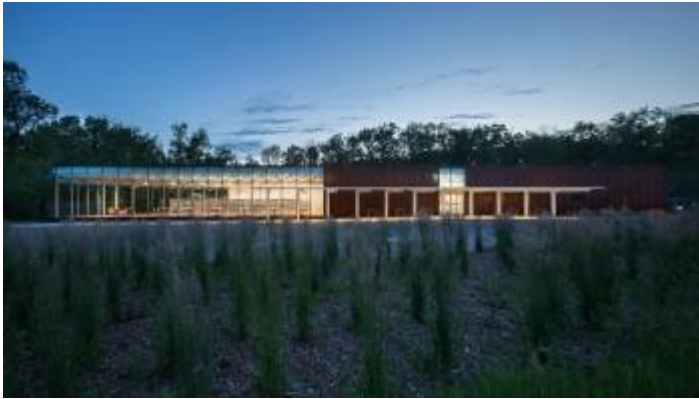
15.3 Winnipeg Public Library, Windsor Park Branch. Exterior at...