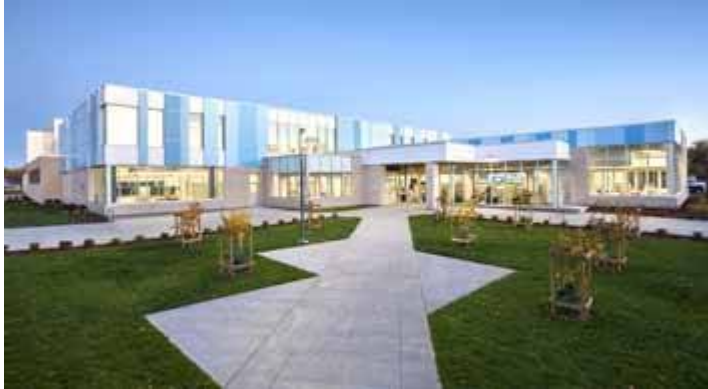
8.1 Regina Public Library, Albert Branch at mâdawêyatitân centre. Exterior....

Regina integrated services centre first of its kind in Canada (accessed Sept 28 2018)