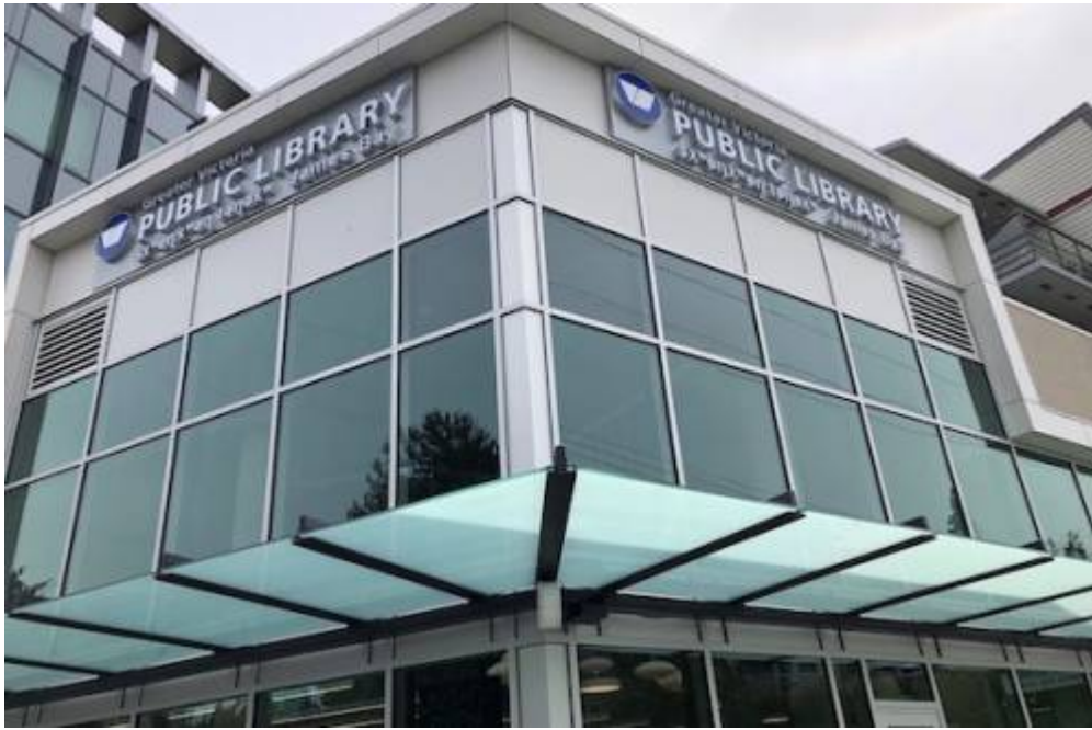
14.1 Greater Victoria Public Library, sxʷenxʷəŋ təŋəxʷ James Bay...