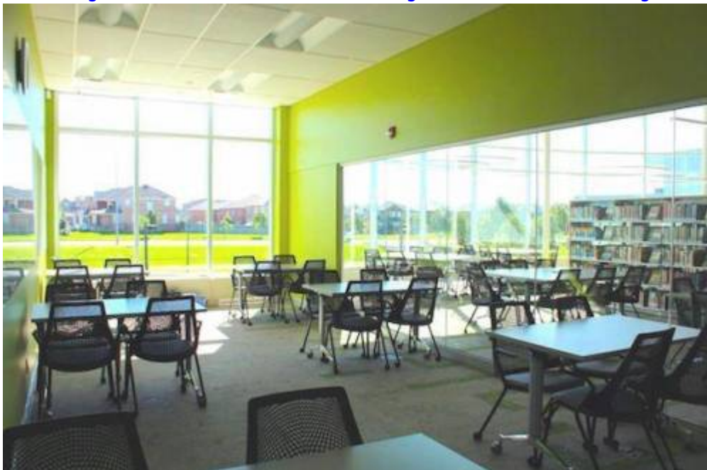
12.4 Vaughan Public Libraries, Vellore Village Branch. Study area. Credit. Vaughan...