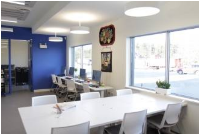
3.4 Halifax Public Libraries, Musquodoboit Branch. Computer and study...