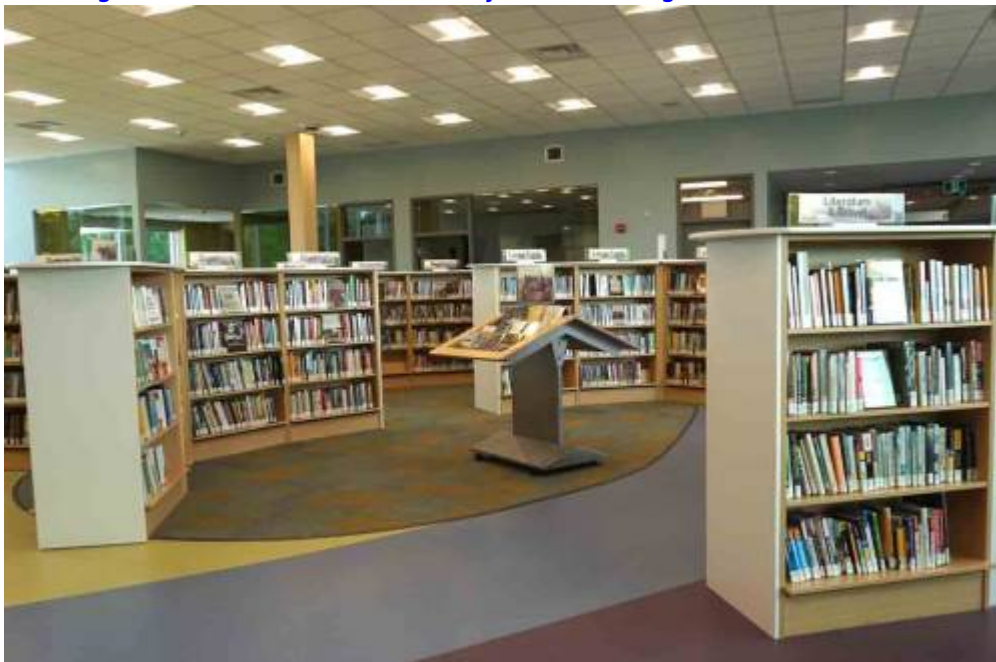
4.4 Kingston-Frontenac Public Library, Rideau Heights Branch. Interior-adult...