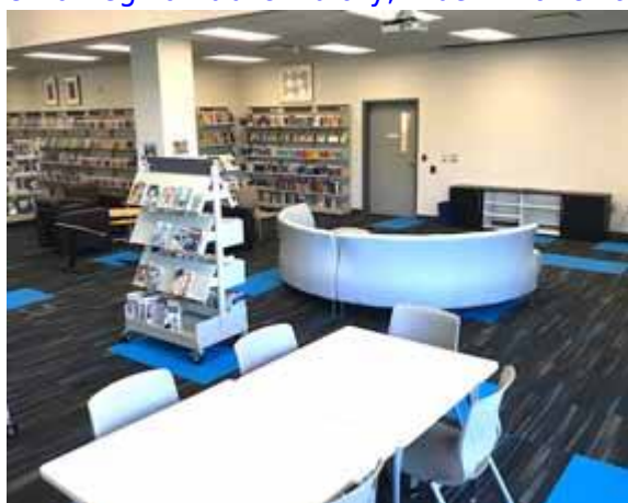
8.11 Regina Public Library, Albert Branch at māmawēyatitān centre.Teen...