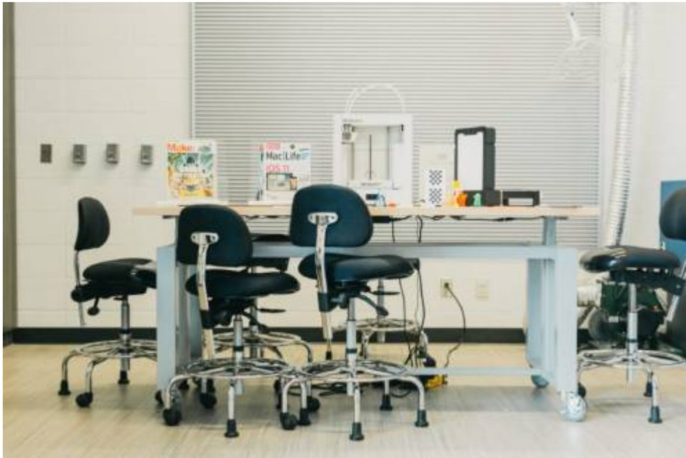
6.7 Markham Public Library, Aaniin Branch.Teen Zone.