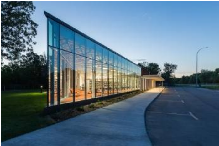
15.4 Winnipeg Public Library, Windsor Park Branch. Exterior at...