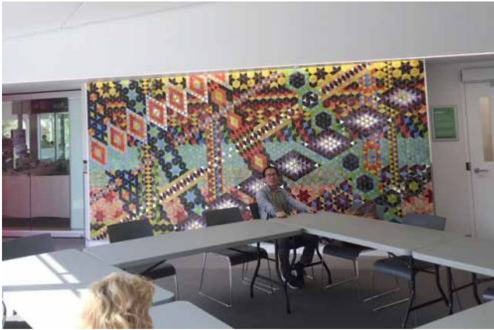
1.9 Edmonton Public Library,Calder Branch. Community mosaic.