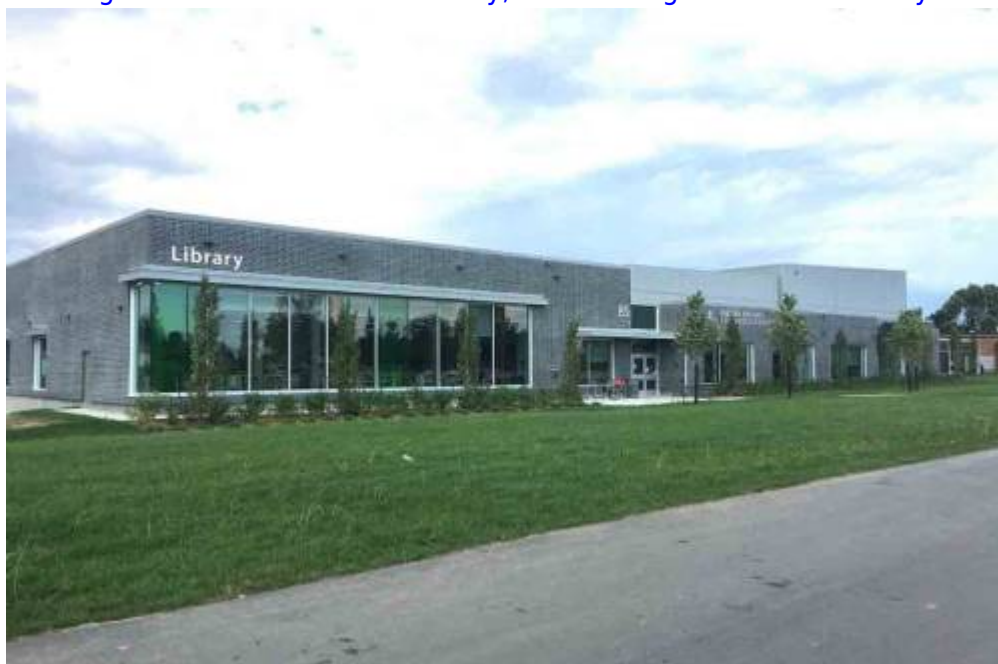
4.2 Kingston-Frontenac Public Library, Rideau Heights Branch. Library Branch and...