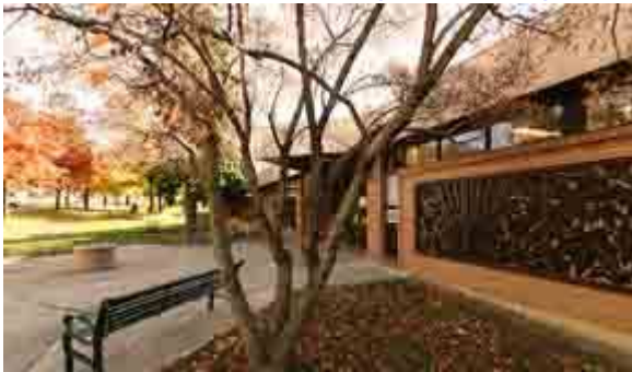
10.2 Toronto Public Library, Amesbury Park Branch. Exterior...