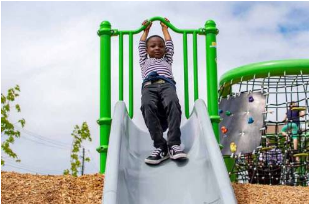
2.5 Halifax Public Libraries, Dartmouth North Branch-Outdoor Library.