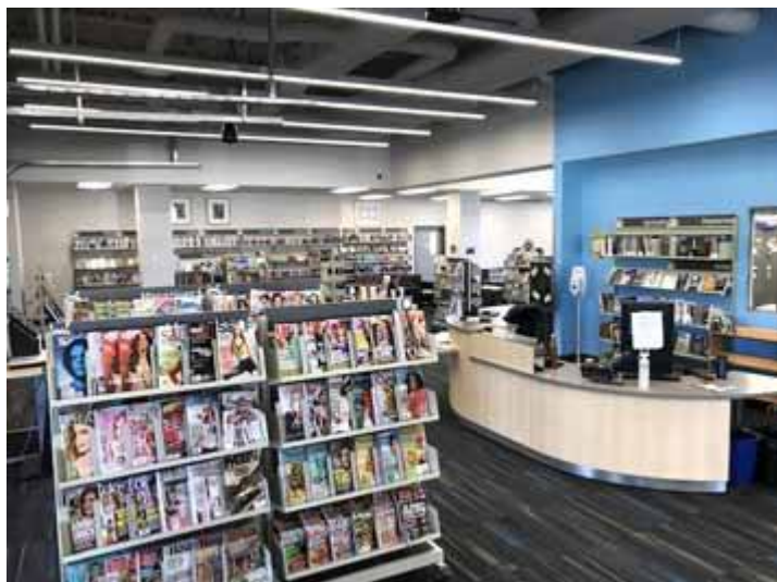
8.4 Regina Public Library, Albert Branch at mawawatatân...