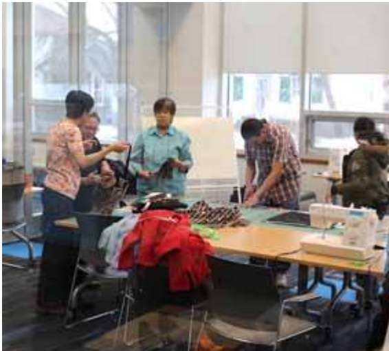
8.9 Regina Public Library, Albert Branch at māmawēyatitān centre. Flex space...