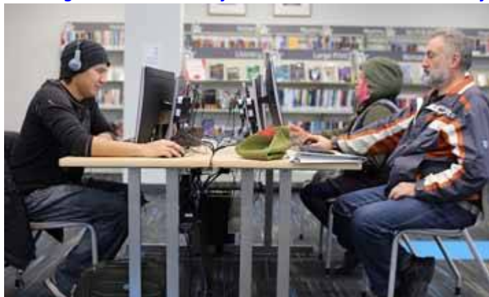
8.6 Regina Public Library, Albert Branch at mawawatatân centre.Computer...