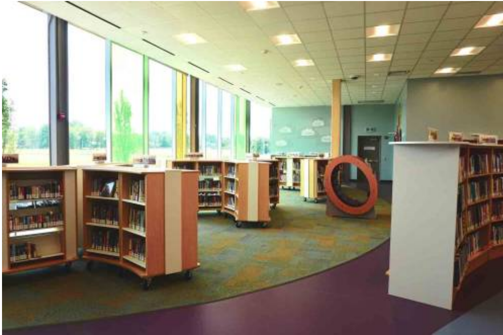
4.3 Kingston-Frontenac Public Library, Rideau Heights Branch....