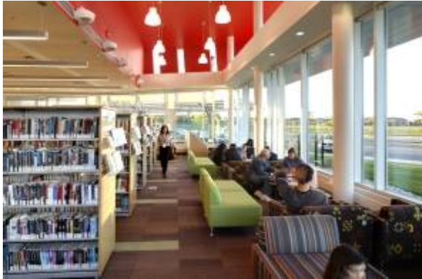
13.4 Vaughan Public Libraries, Pleasant Ridge Branch.